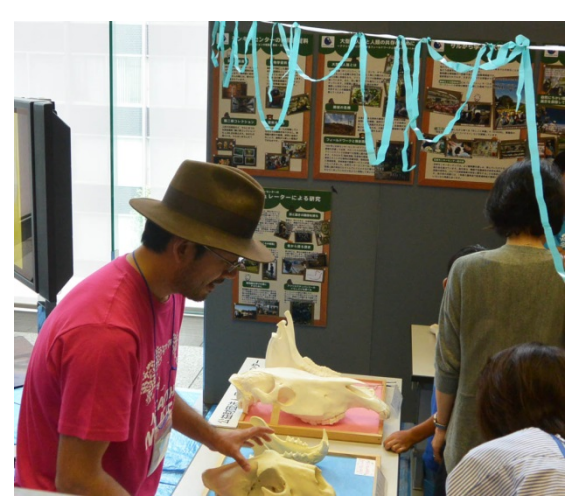
Hands-on learning of animal skulls