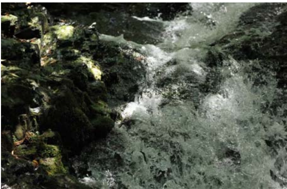
A stream in Yakushima

Submit to: report@wildlife-science.org 2014.05.27 version