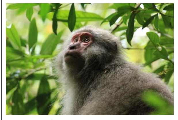
A monkey resting on a tree

I went to Yakushima island for field science course by PWS. I belonged to the group which researched Yakushima macaques. We conducted a direct observation and fecal sampling. We collected 25 feces for DNA analysis. The survey was held for four days.(5/20-5/24) It was great experience for me because I had little experience of field work. All of this course was held by English. It was so hard but my English speaking was a little better than past. I hope this course help my research someday.