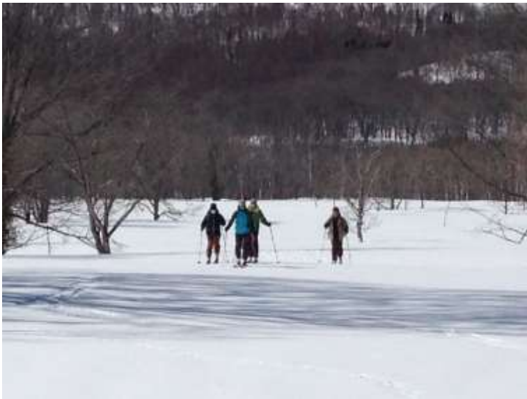
▲Climbing up to a slope with skis