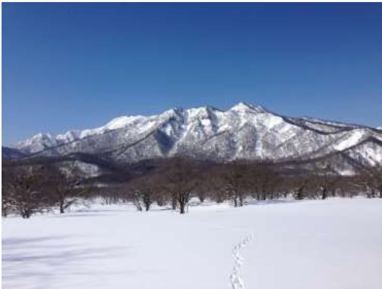
▲ The animal track on snow