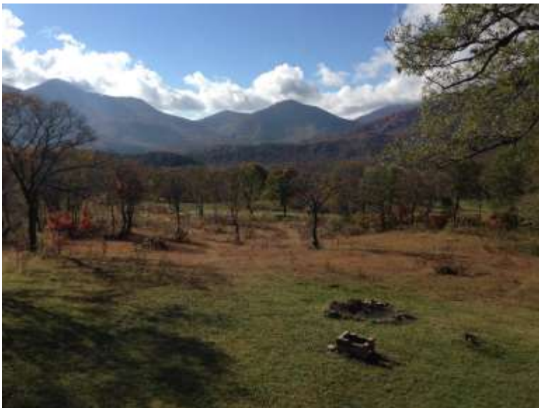
▲ The autumn view from the same