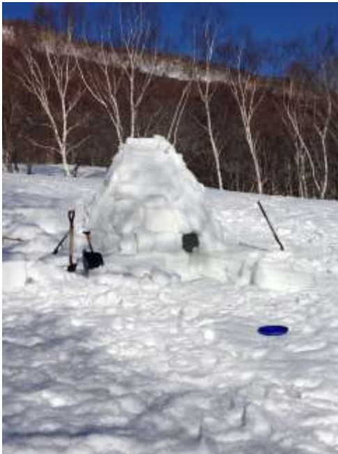
▲Igloo (version; Kyoto University Mountaineering Club)