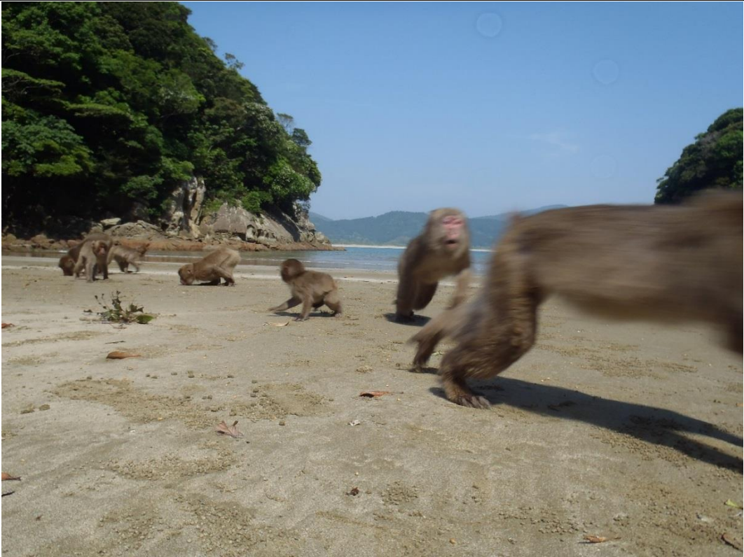
Competition over food