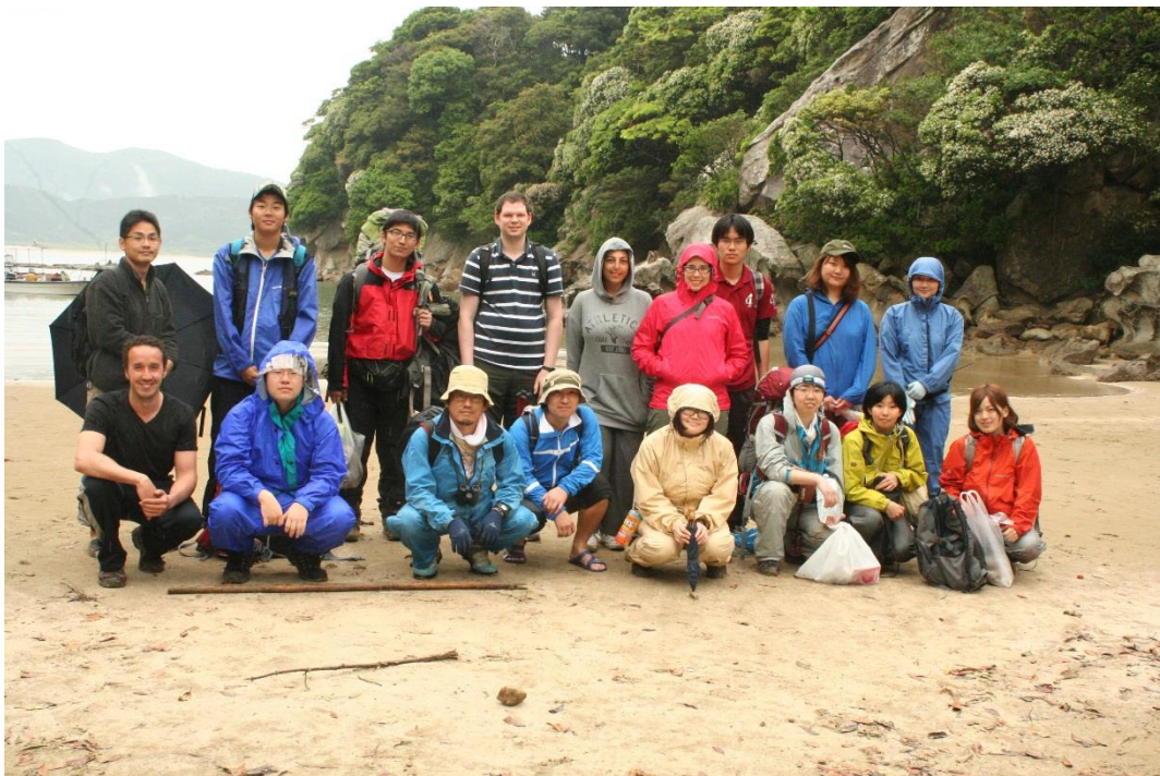
Group photos