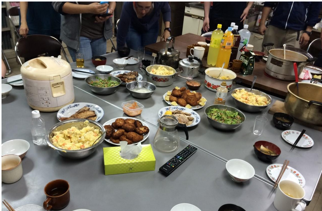
Food made by students