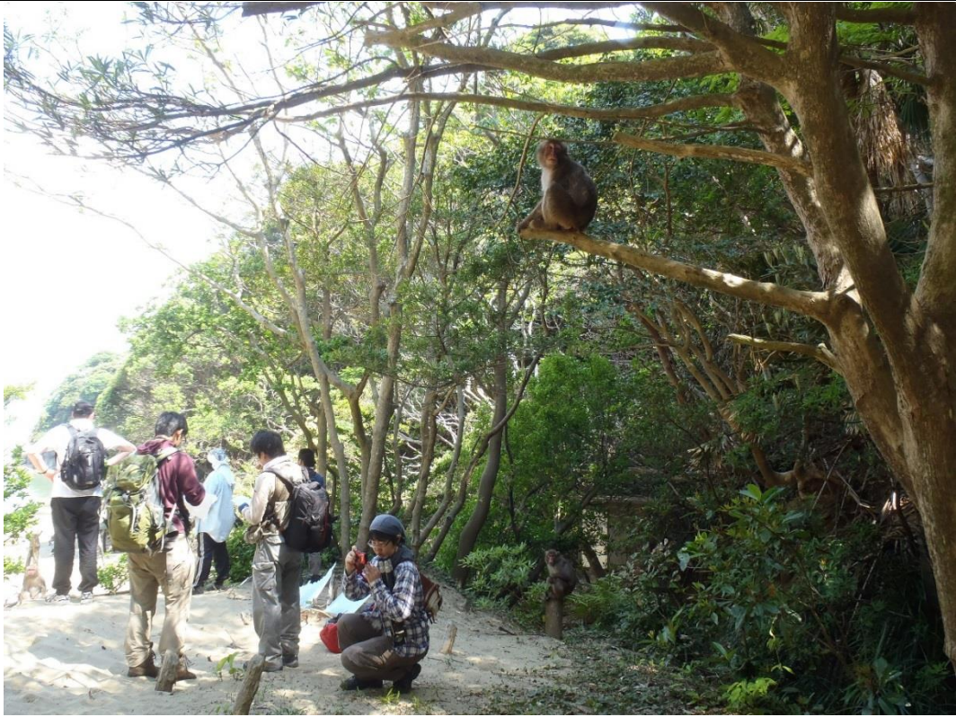
Students and macaques