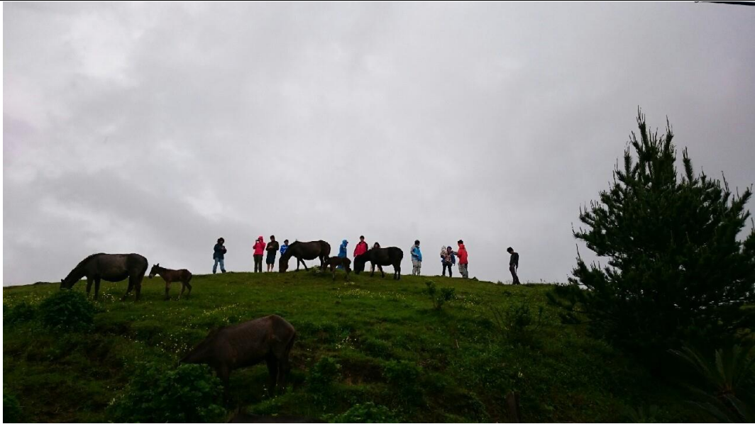
Observation on wild horses at toi-cape