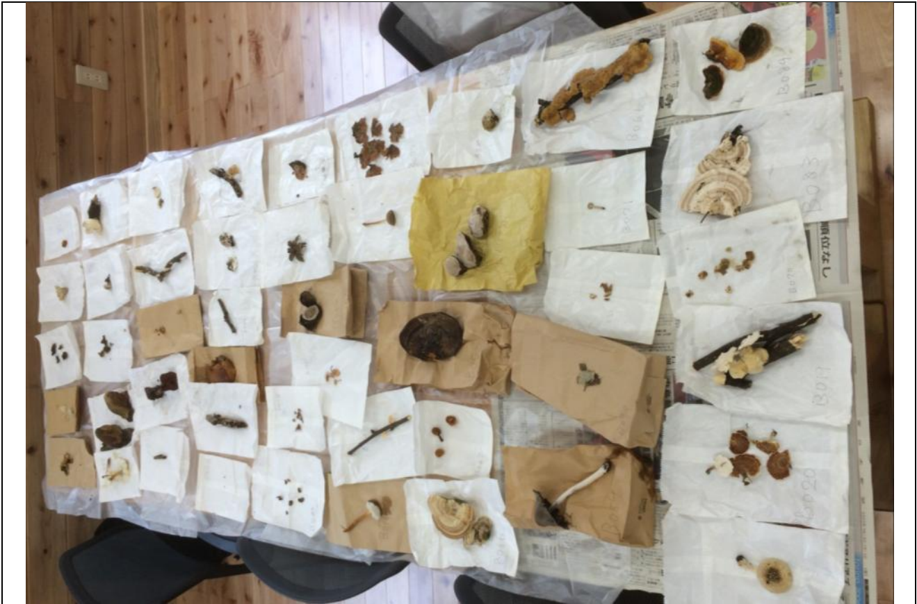
Collection and sorting of mushrooms at the field station