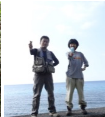
Ice creams after hard work.