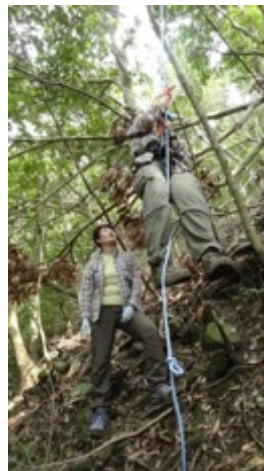
Practice of tree climbing.