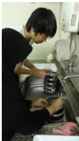
We washed the feces using sieves.