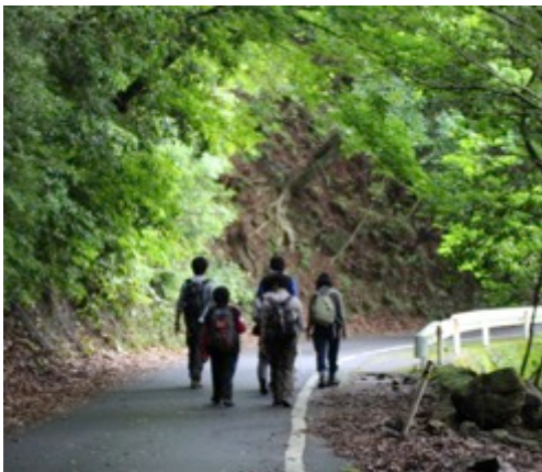
We searched for monkeys along the road.