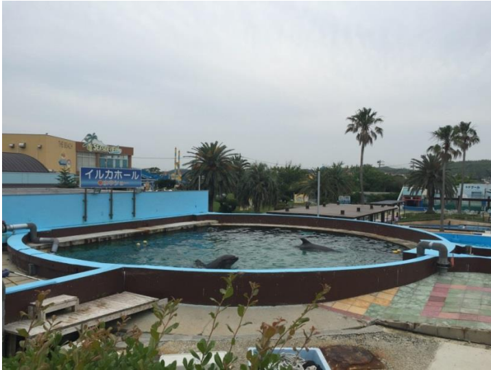
Observation from outside