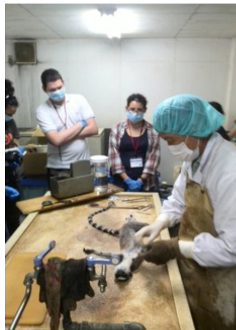
Dissection of a dead ring-tailed