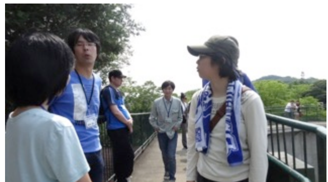
. Explanation of Zoo exhibition.