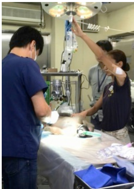
Veterinary operation for an injured macaque.