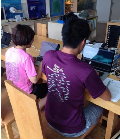
Fig. 2 individual identification