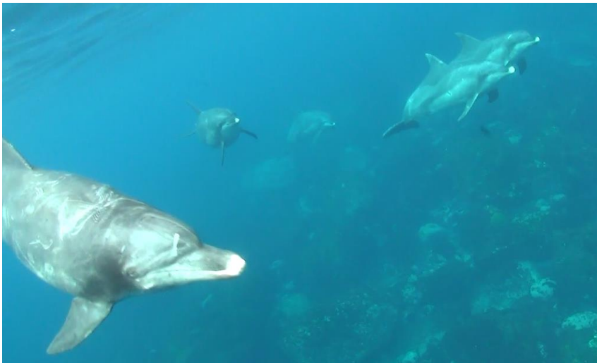
Fig. 3 pair swimming pairs (right side)