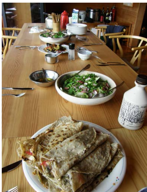
Galettes bretonnes for breakfast. “Survival course”?