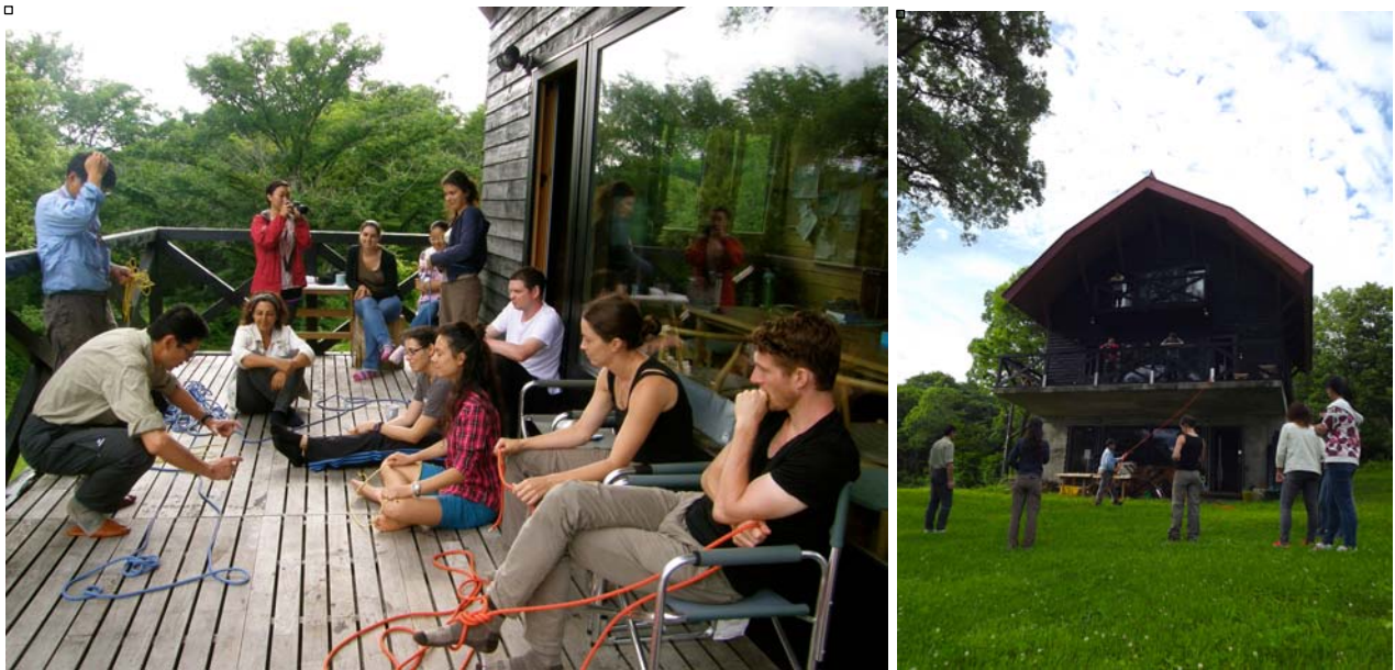
Left: Knot workshop; right: climbing practice