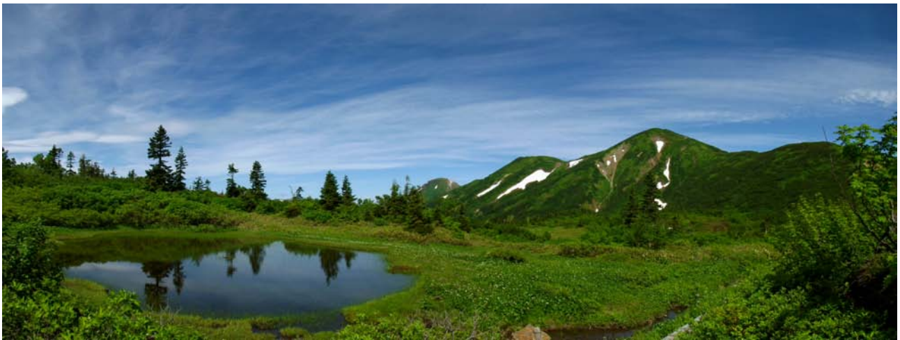
Panoramic view on the foot of Mt Hiuchi