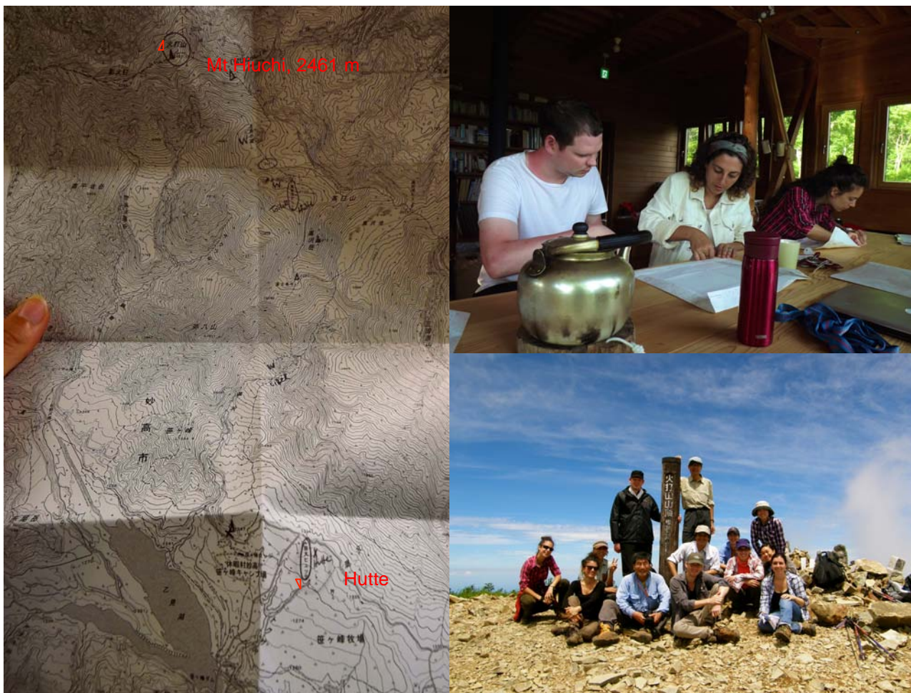
From the map reading workshop to the summit (2461 m). It took us 5h20min to reach the top...