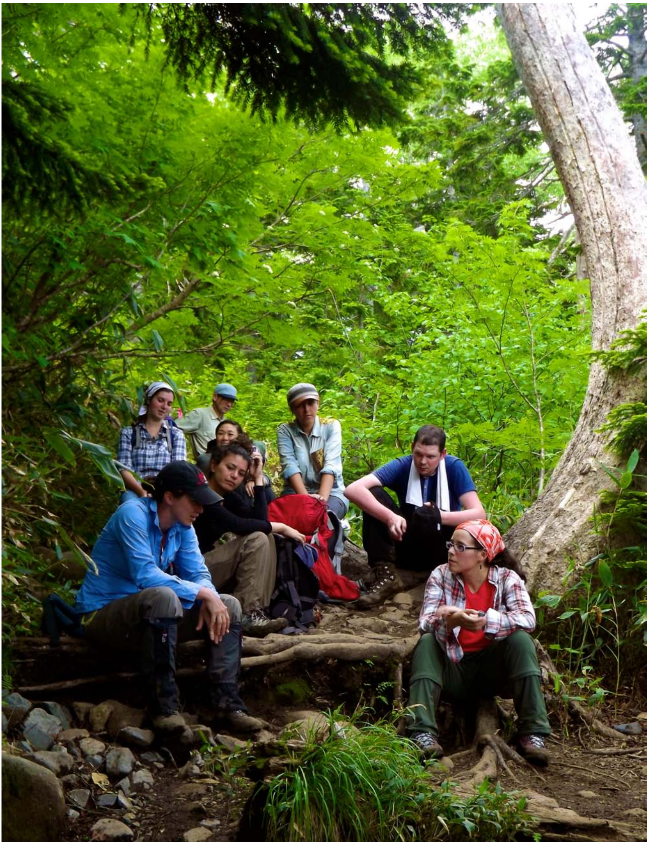
Resting primates on the way back