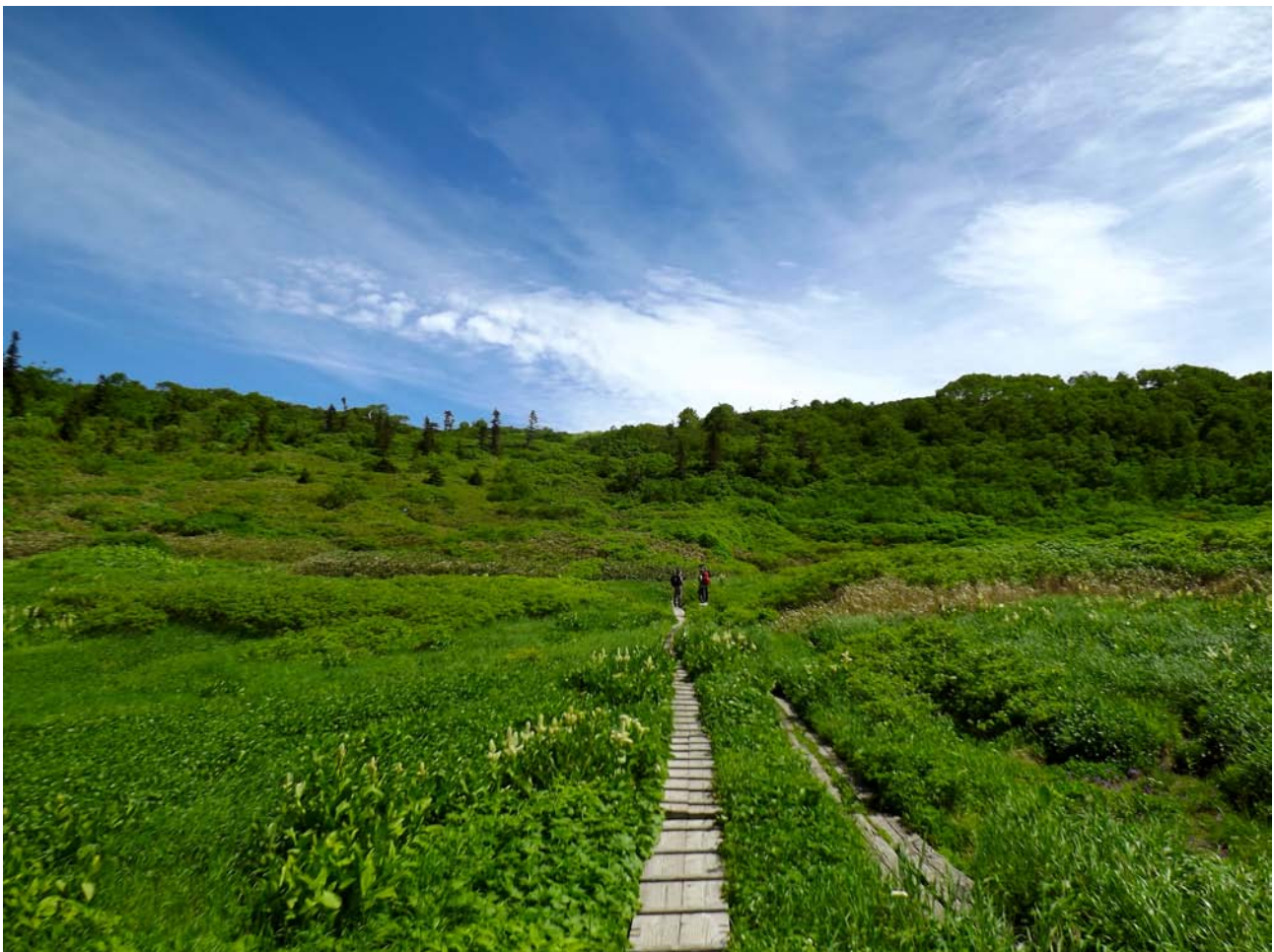
On the way to the peak