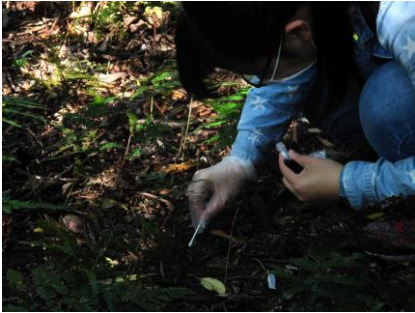
Fig. 1. Feces sampling.

Now we are using the samples we collected in experiments for deer sex determination. And we will give presentation and writing a specific report to show our result.