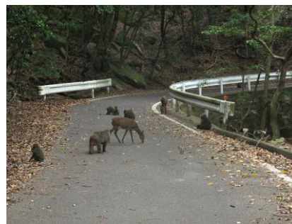
Fig. 5. Close relationship between deer and macaques.