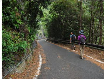
Fig. 2. Look for deer groups.