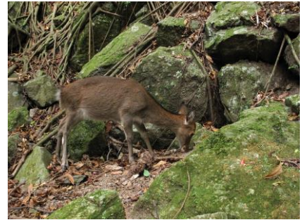
Fig. 3. An adult female sika deer..