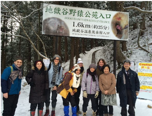
Our group about to start the hike up the mountain.