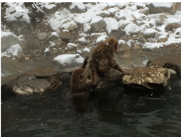
Monkeys grooming in the hot spring.