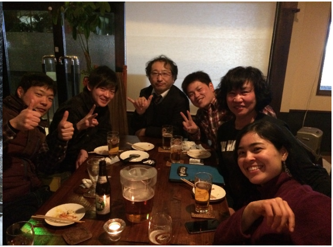
Dinner with the staff from the monkey park and colleagues.