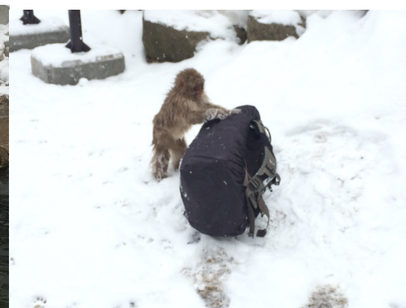
Monkey playing with bag.