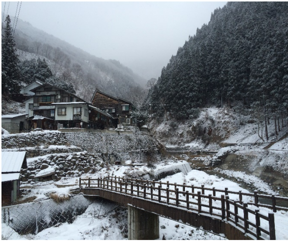
A view from the monkey park.