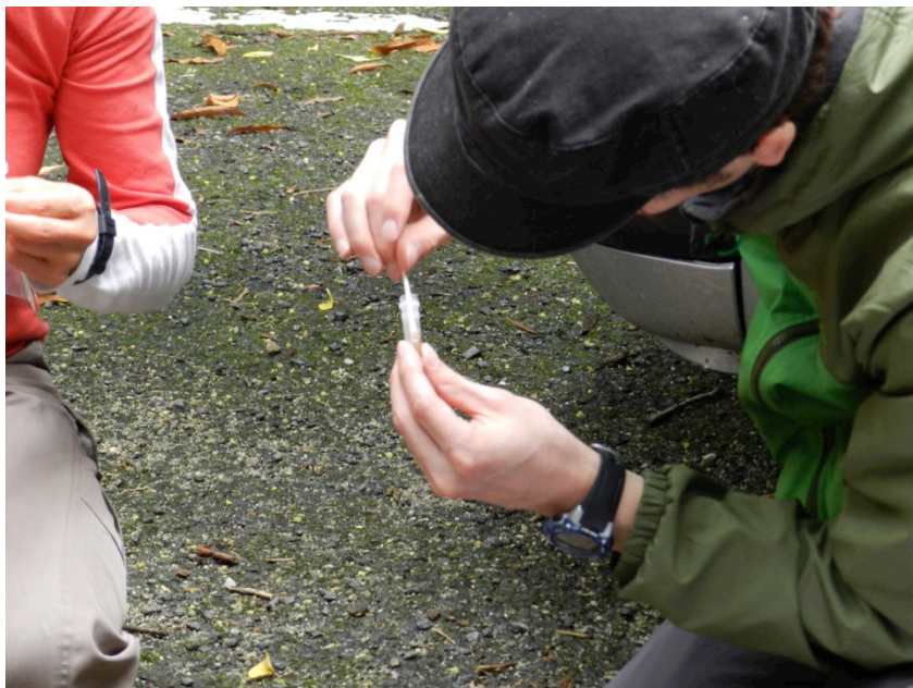
Fecal DNA sampling