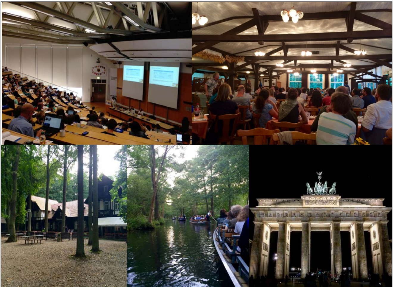
Fig. 2. Last day of the EWDA Conference (top left) and auction at the Spree forest (top right). The Spree forest, a UNESCO biosphere reserve in the south of Berlin, known for its traditional irrigation system (lower left and middle) and Brandenburg Gate, famous landmark in Berlin.