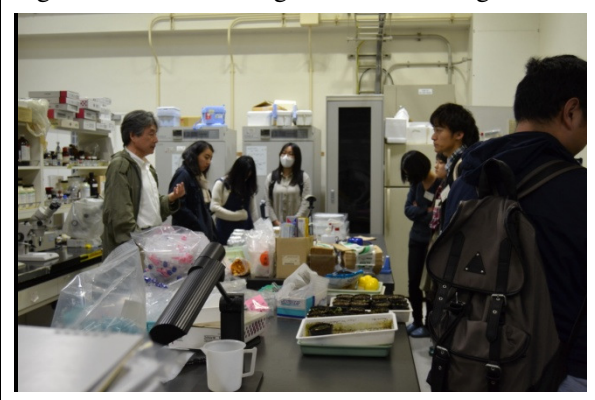
Figure 6. Symbiotron explanation.