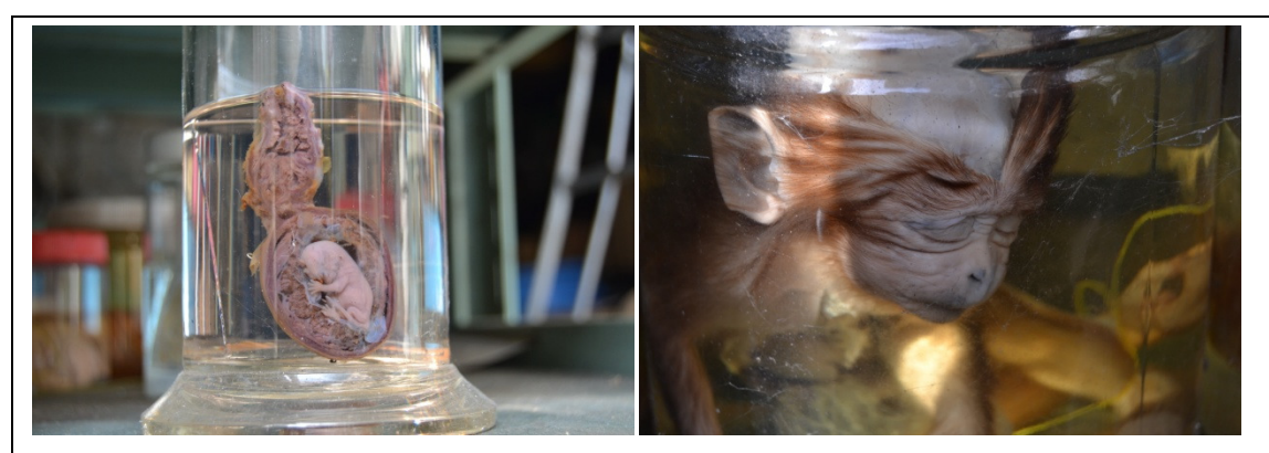
Figure 13 and 14. Fetus and baby macaque preserved in formaldehyde.