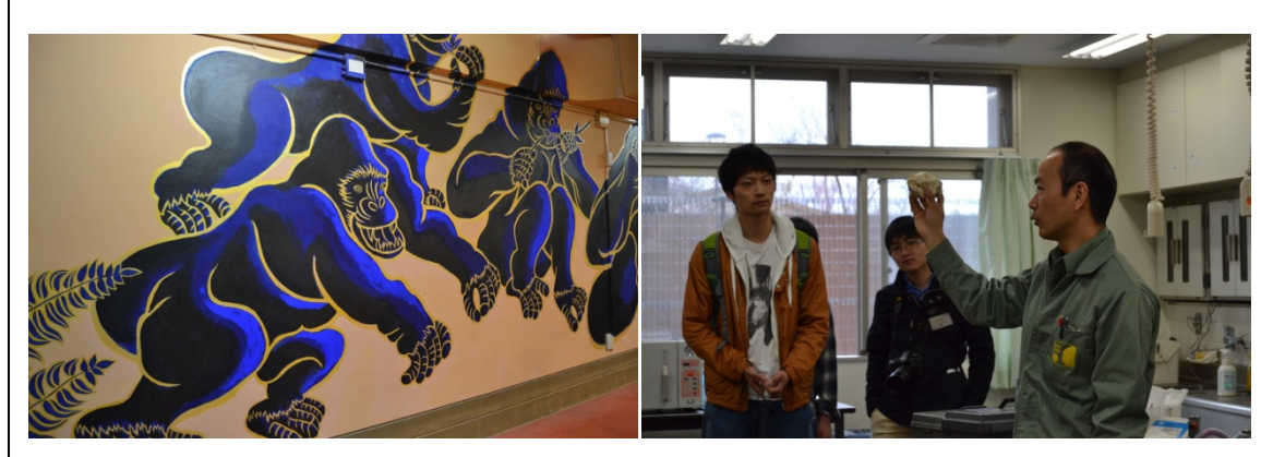
Figure 3 and 4. Gorilla paintings in great apes visitor house (left) and zoo staff explaining the veterinary routines and conservation programs in the Zoo (right).

Figure 1 and 2. Animals in public exhibition in Kyoto City Zoo: elephants playing (left) and adult giraffe (right).