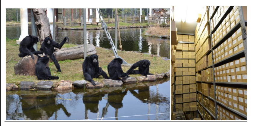
Figure 11 and 12. Siamangs family (left) and the Captive Primate Collection (right).