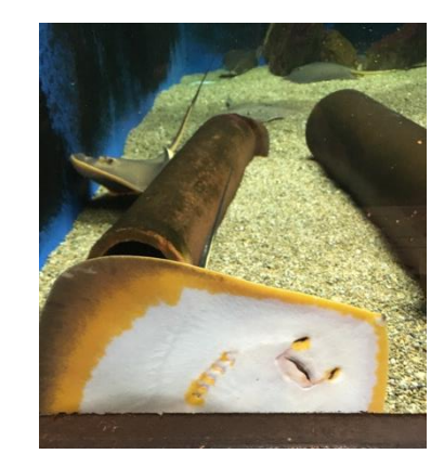
Figure 2. Ray in the aquarium

We went to Shirahama aquarium located in Wakayama. Because of far distance, we arrived at afternoon. After settled down, professors gave us impressed lectures about Shirahama history and marine diversity. Shirahama aquarium is one of longest history aquarium over Japan, which already 77 years old. The researchers are not only studying on ecology and taxonomy of marine, but genealogy and phylogeny. It is impressed that using GFP to study on the parallel evolution of conch on Pacific Ocean and Atlantic Ocean. My interests are to understand phylogeny secret and evolutional