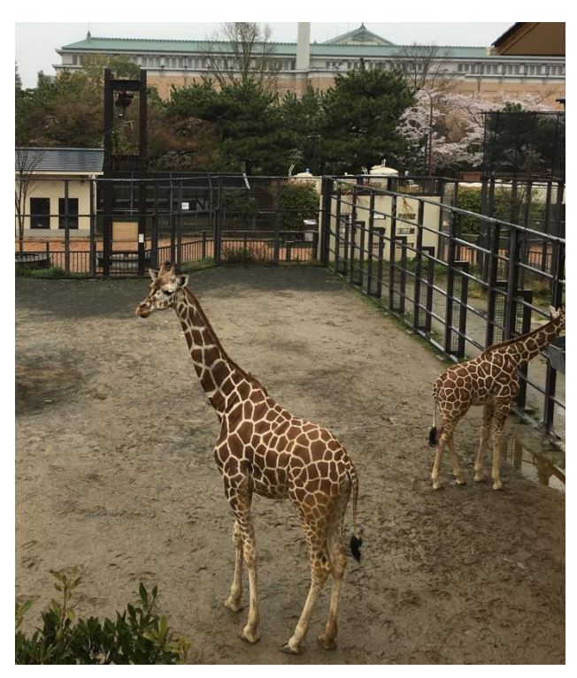
Figure 3. Giraffe in Kyoto City Zoo

We visited Kyoto City Zoo. For me, it was the second time to be here. With the guidance by zoo keepers, we got the unique opportunity to visit the dissection room and veterinary room. Because there was not many medicinal study about each kind of animals, flocculent dosage is based on dosage of human. We also walked around the zoo and heard from zoo keepers about the zoo management and animal's diet and lifespan.