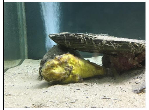
Figure 1. Fish exhibition in Shirahama aquarium