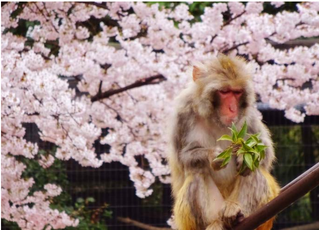
Fig.2 Rhesus Monkey in Kyoto city zoo