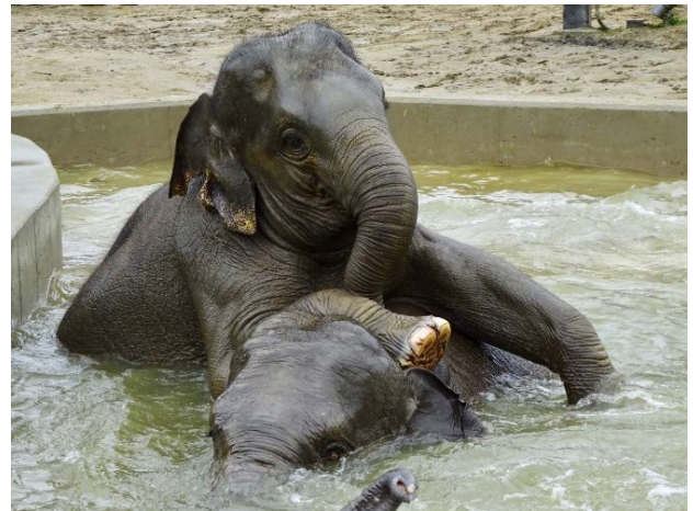
Fig.3 Asian elephants in Kyoto city zoo