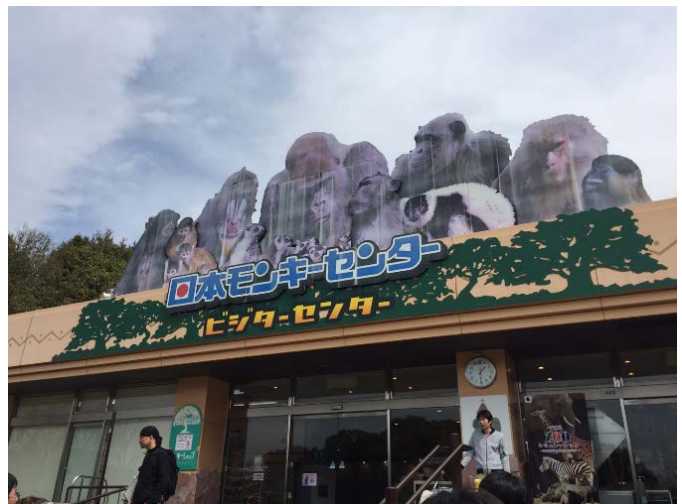
Fig.4 Japan monkey center