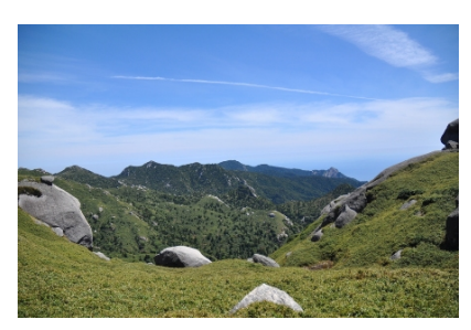
Fig9: View from Mount Miyanoura.