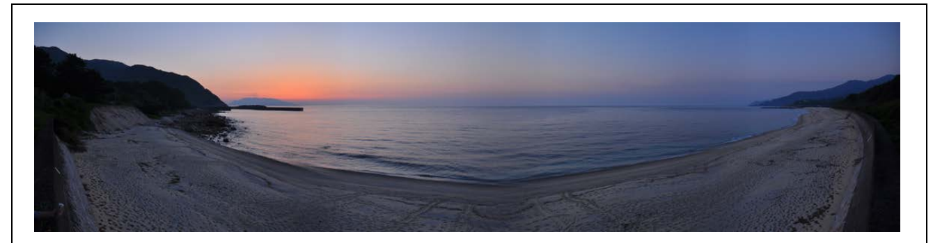
Fig 13: View of the beach at sunset from PWS. Turtle tracks can clearly be seen on the sand.