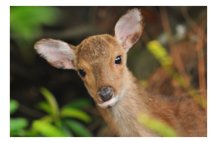
Fig7: Sika deer of Yakushima Island