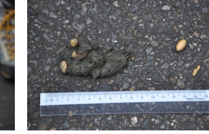
Fig6: Feces with 'Bari-bari' seeds.