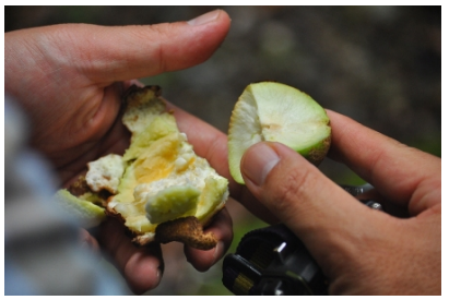
Fig2: A hard-texture fruit, which after infected with fungus will become soften and eaten by Japanese Macaque.