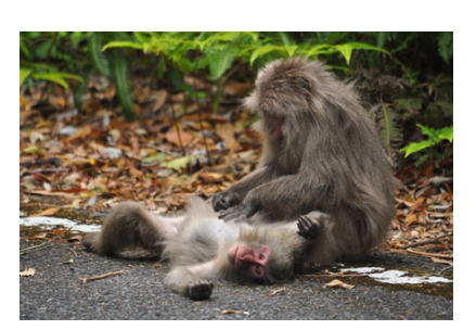
Fig3: Japanese Macaque grooming

Fig2: A hard-texture fruit, which after infected with fungus will become soften and eaten by Japanese Macaque.