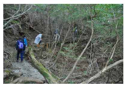
Fig8: MDT hiking up to Mount Miyanoura.