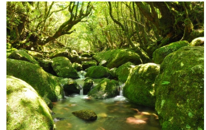
Fig11: Shiratani Unsuikyo Ravine forest.