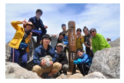
Fig10: Monkey Deer Team at the peak of