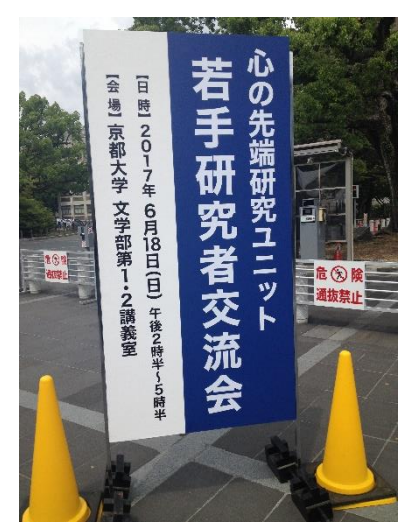
Fig. 2. Meeting announcement outside the University.