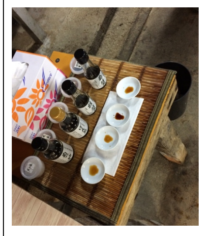
Soy sauce tasting