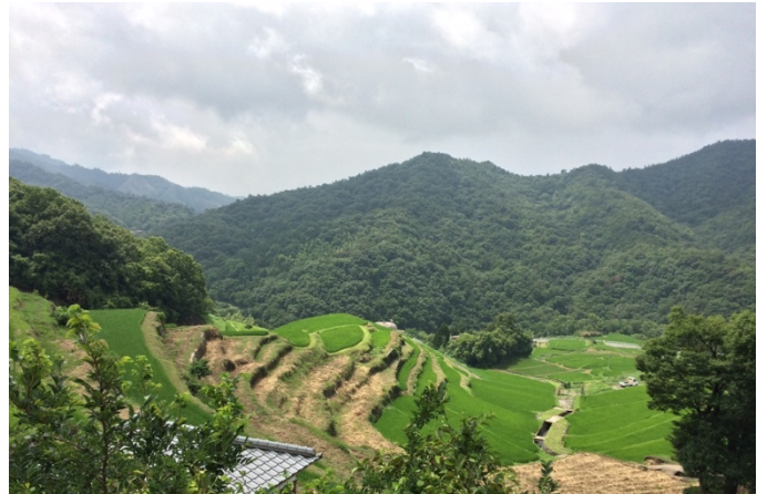
Special terrace field for agriculture