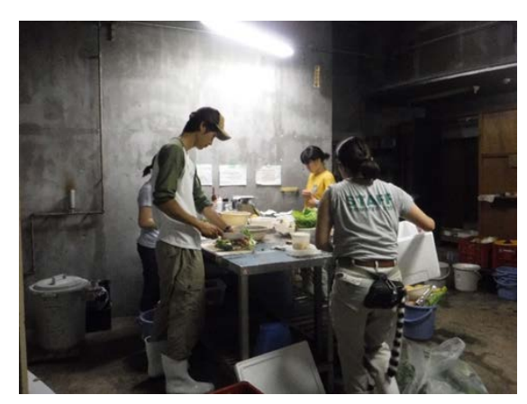
Pic.2 Cutting fruit and vegetables for primates