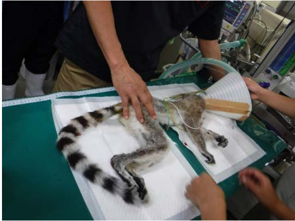
Pic.4 general anesthesia to Lemur catta