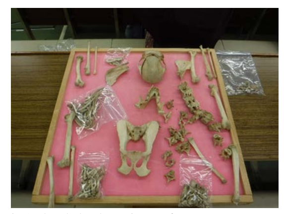
Pic.1 The skeletal specimen of Japanese macaque