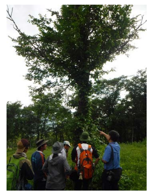
Pic.1 Walk in the forest, listening the lecture by Sugiyama-sensei

The purpose of this Sasagamine course was to learn the basic knowledge for fieldwork and to enjoy the nature of Sasagamine. I have learnt many things (how to use zelt, how to walk in the forest, etc.). The climbing of Mt. Hiuchi was quite hard, but the landscape was great and it was very enjoyable.