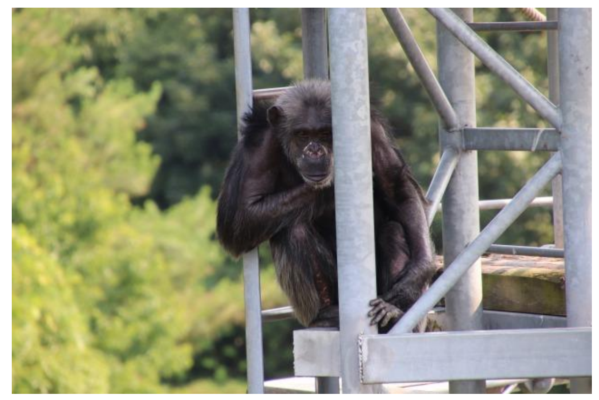
Chimpanzee (Chloe) at ground