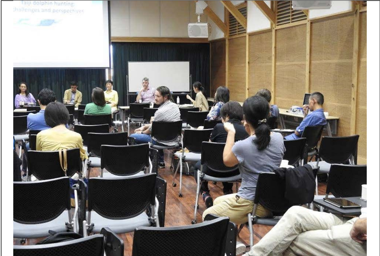
Discussion with the audience on Taiji dolphin hunting