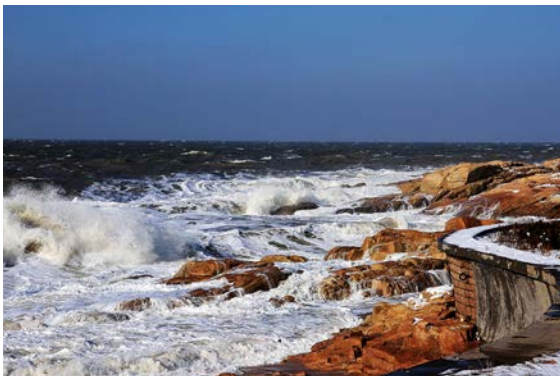
Xixiakou safari zoo