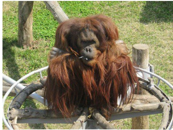
Orang-utan in Xixiakou safari zoo