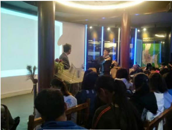
Speech in Lijiang