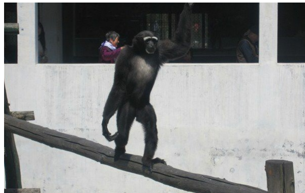
Hoolock gibbon in Xixiakou safari