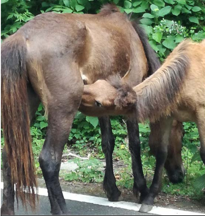
Figure.2 Nursing of wild horses in Cape Toi