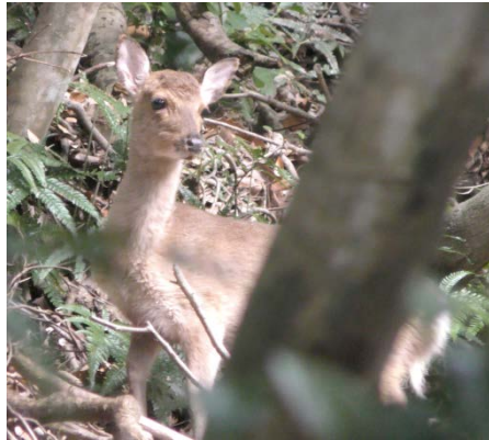
Figure 4: Cervus nippon yakushimae