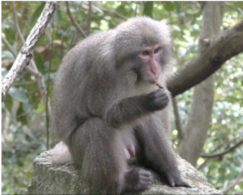
Figure 3: Macaca fuscata yakui

Moreover, these experiences I got in this course will surely help me to develop my studies and give new scientific ideas in the future.