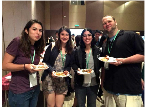
Fig 4. Colleagues of snake team in Thailand