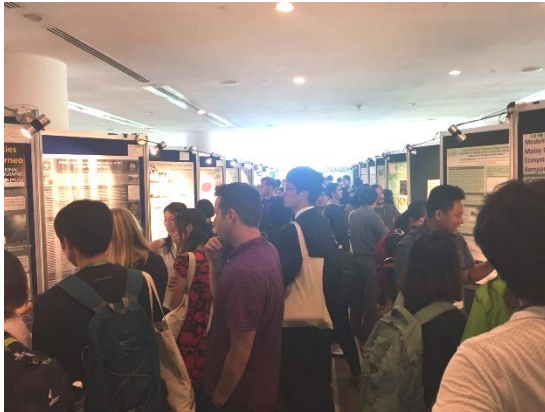
Fig 3. Core time of poster presentation