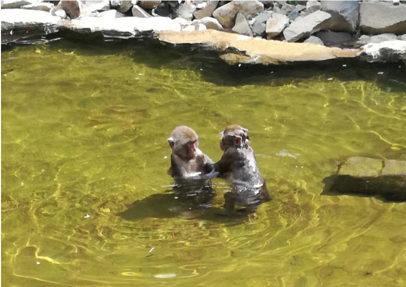
Figure.2 Child Japanese macaques in Jigokudani