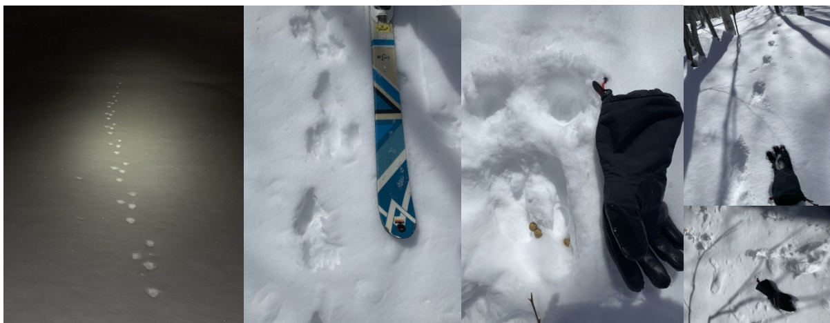
Footprints of fox, monkey and hare