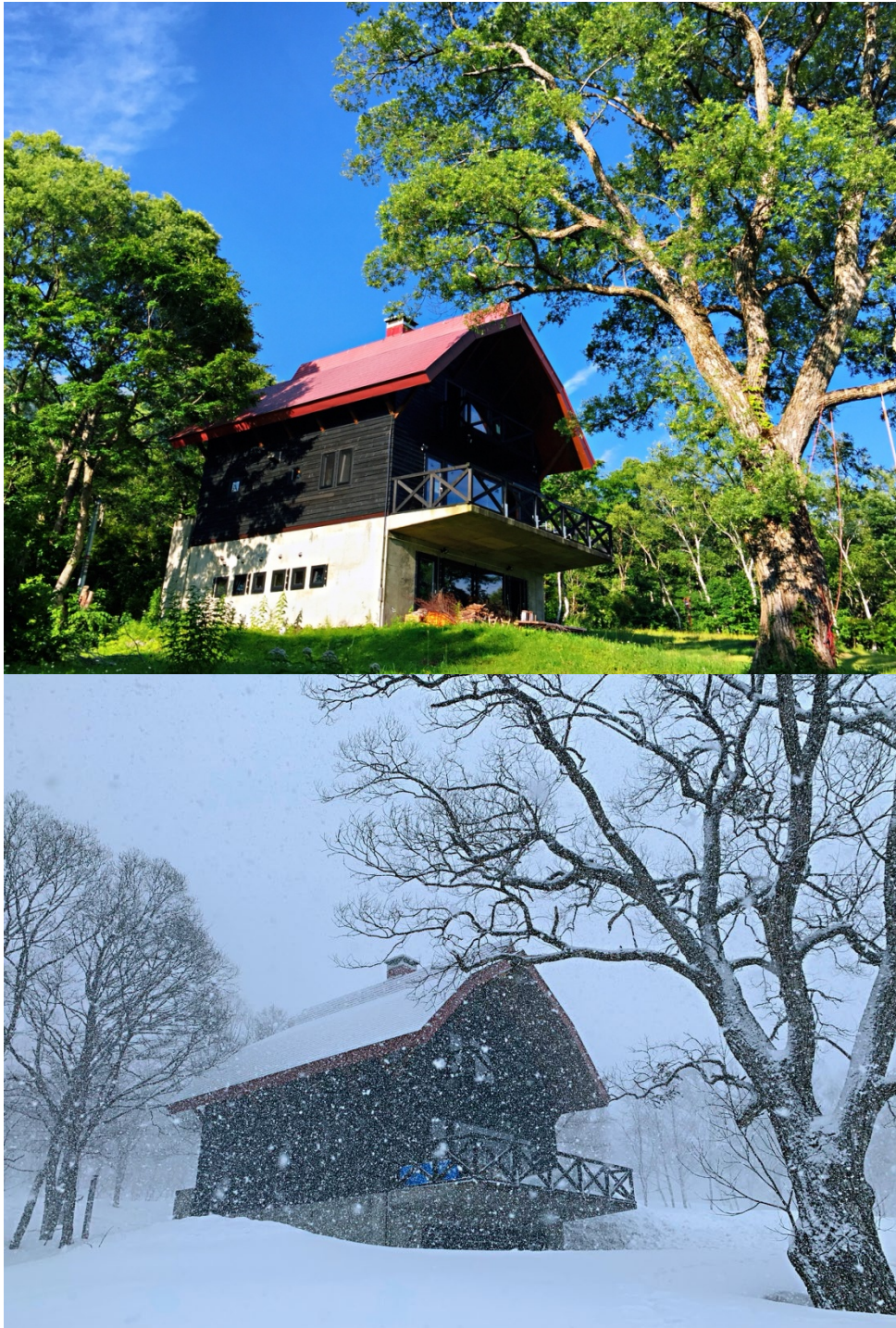
Kyoto University Sasagamine Hütte in Summer and Winter