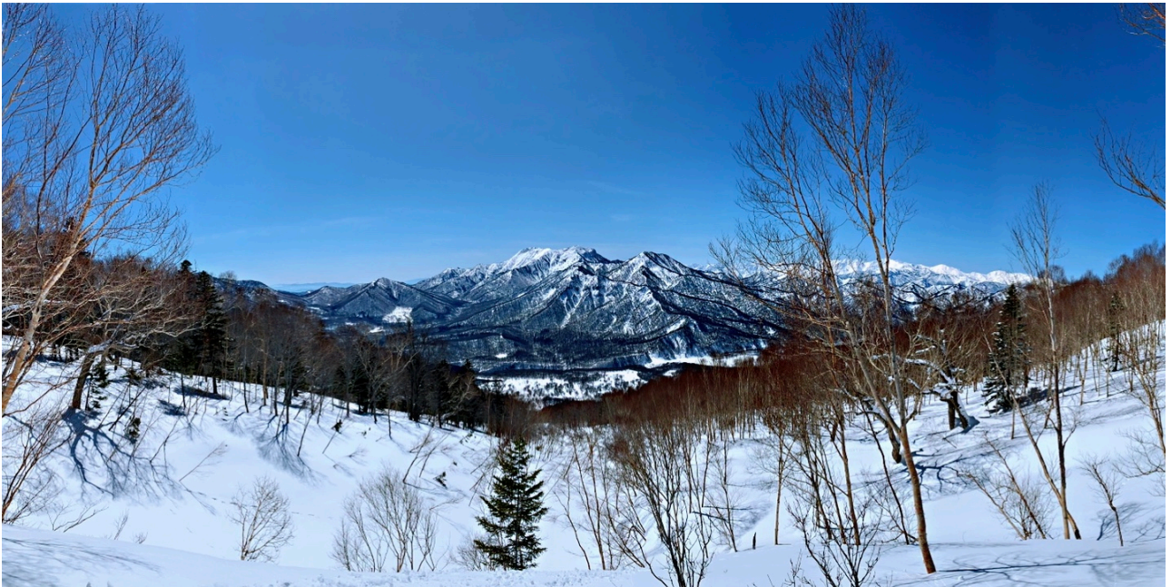
PWS academic year 2019 Winter student program in Sasagamine