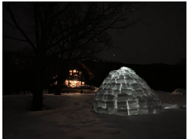
Building the igloo nearby the Kyoto University Sasagamine Hütte