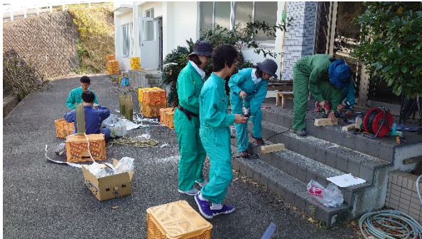
Making devices by our own