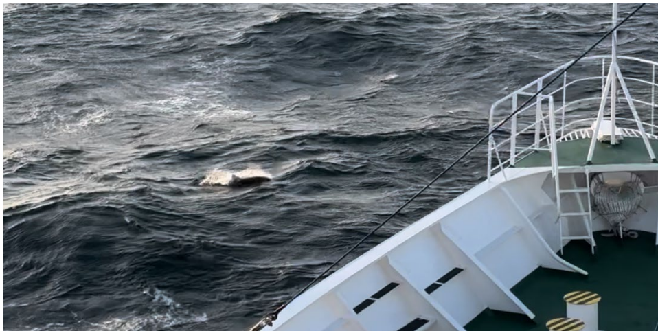
Figure.3 Dall's porpoise crossing the front of the vessel bow.