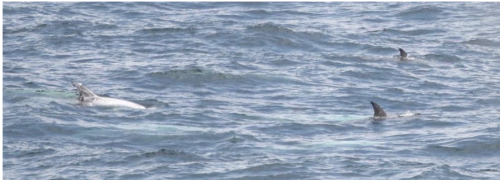
Figure.1 A school of Risso’s dolphin.