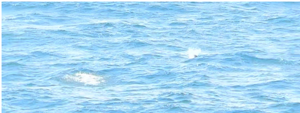
Figure.2-1 Fur seals swimming 1.