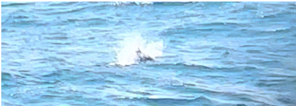
Figure.2-2 Fur seals swimming 2.