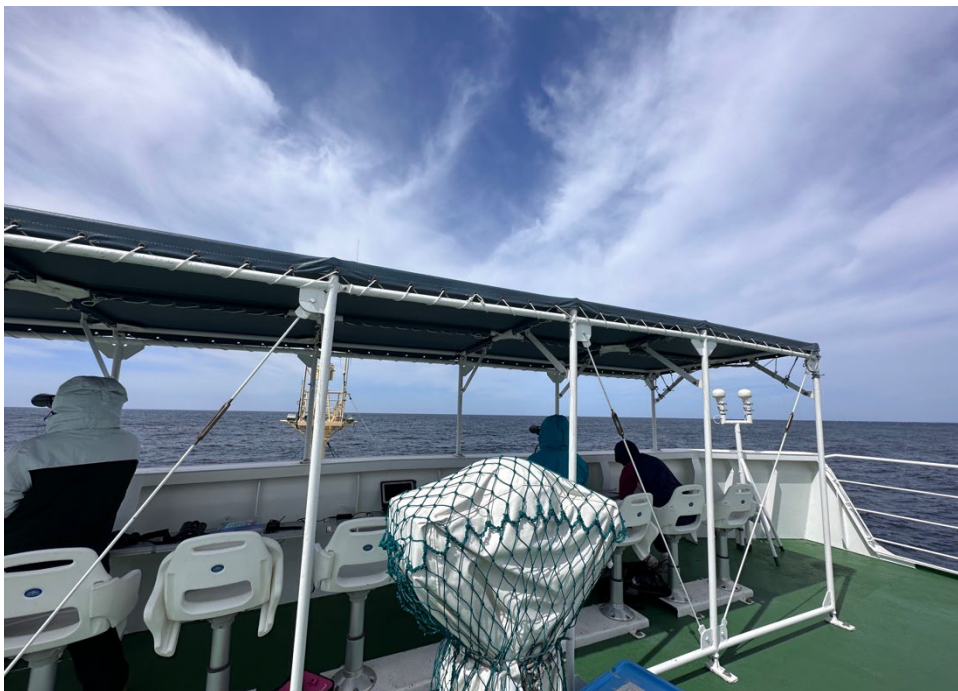
Figure.4 A view from the upper bridge.