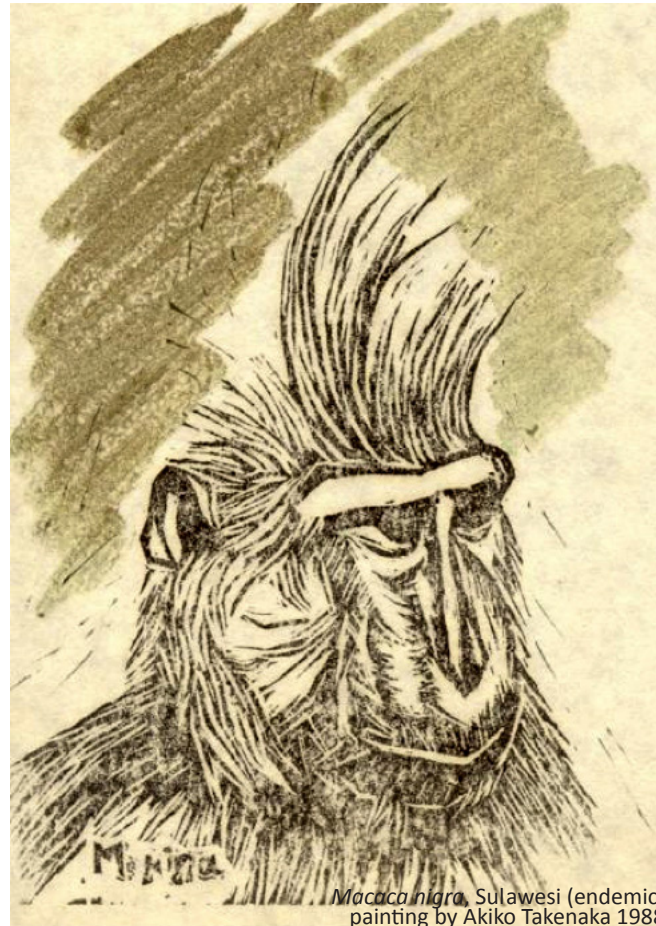
Macaca nigra , Sulawesi (endemic) painting by Akiko Takenaka 1988