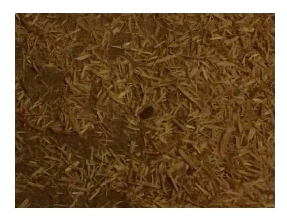
The cage and the feces

Submit to: report@wildlife-science.org 2014.05.27 version