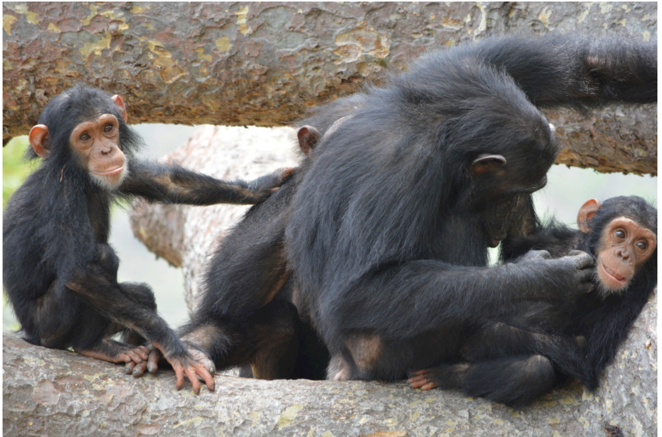
Figure 7. Mother chimpanzee and 3 young individuals. She is grooming one individual and receiving grooming from another.

In total I believe we saw more than 30 individuals in that day. It was my first time seeing wild chimpanzees, and the second time seeing a wild ape (after orangutans), and I already could notice so many differences in both ways. Chimpanzees from zoos do not seem so active, which is the total opposite from wild ones. Those are curious, constantly moving, feeding or grooming. I could even see a case of individuals showing the “begging behavior”, as explained by the guide (Figure 8).