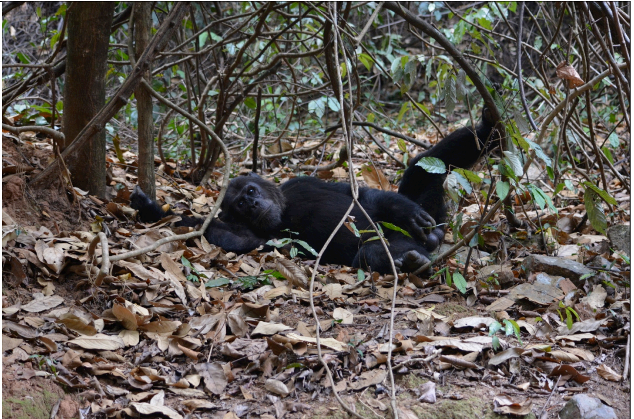
Figure 11. Alpha-male resting on the ground.

In the afternoon, we took the boat to Kigoma, where we spent the night before we went back to Dar Es Salaam. There, we spent the last night of the trip at the top of the New Africa Hotel, eating Thai food while enjoying the night view.