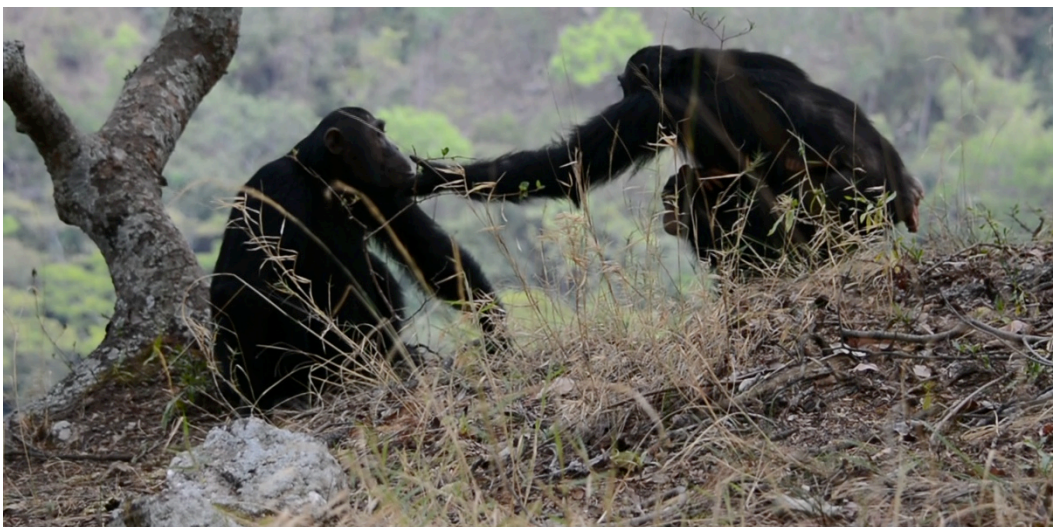
Figure 8. “Begging behavior” from a subordinate to a high-ranked individual.

In total I believe we saw more than 30 individuals in that day. It was my first time seeing wild chimpanzees, and the second time seeing a wild ape (after orangutans), and I already could notice so many differences in both ways. Chimpanzees from zoos do not seem so active, which is the total opposite from wild ones. Those are curious, constantly moving, feeding or grooming. I could even see a case of individuals showing the “begging behavior”, as explained by the guide (Figure 8).