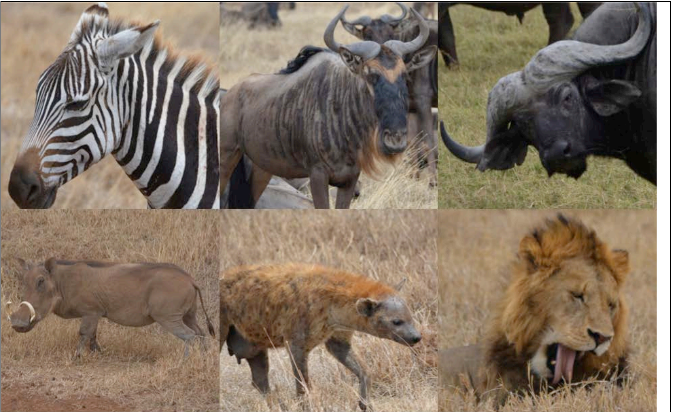
Figure 3. From top left to bottom right. Zebra ( Equus burchelli ), gnu ( Connochaetes taurinus ), buffalo ( Syncerus caffer ), wild boar ( Sus scrofa ), spotted hyena ( Crocuta crocuta ), and lion ( Panthera leo ).