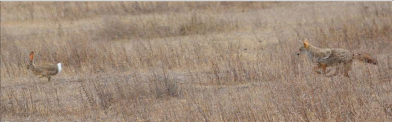
Figure 5. Golden jackal ( Canis aureus ) chasing a hare

In the next morning, the group split in Gombe and Zanzibar tours. I joined the first one. Traveling by air, road, and lake, we reached Gombe National Park in the late afternoon. By the shore of Lake Tanganyika, Gombe is the smallest of Tanzania's national parks (52 km 2 ), 16 km north of Kigoma. Before arriving, we could already spot many olive baboons on the shore, probably feeding on shellfish. I was very excited for being in the place where Jane Goodall started a pioneer work on chimpanzee ( Pan troglodytes schweinfurthii ) research in the early 60s, when she founded a behavioral research program. Currently, Dr. Anthony Collins occupies Jane's house and conducts research on both chimpanzees and baboons. He kindly showed us the house and talked about his work (Figure 6).