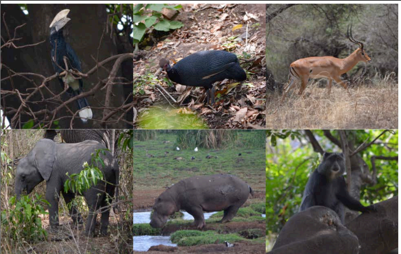
Figure 2. From top left to bottom right. Hornbill ( Ceratogymna brevis ), guineafowl ( Numida meleagris ), impala ( Aepyceros melampus ), elephant ( Loxodonta africana ), hippopotamus ( Hippopotamus amphibius ), blue monkey ( Cercopithecus mitis )

In the next morning, we drove to Ngorongoro Crater to see the wild animals. On the way down the mountain, I could see a giraffe, very close to our car. Too bad that we couldn't stop to take pictures, because this was the only giraffe seen clearly during this trip. I was very lucky! Unlike Lake Manyara, NCA is more savanna-like environment. There are over 20,000 animals living there, mostly ungulates. We could see zebras ( Equus burchelli ), gnus ( Connochaetes taurinus ), buffalos ( Syncerus caffer ), wild boars ( Sus scrofa ), hippopotamus, gazelles ( Gazella granti ), hyenas ( Crocuta crocuta ), elephants and lions ( Panthera leo ) (Figure 3). We also saw many vervet monkeys and olive baboons, flamingos ( Phoenicopterus roseus ), and grey crowned crane ( Balearica regulorum ) (Figure 4).