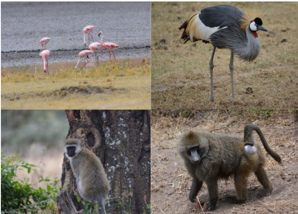
Figure 4. From top left to bottom right. Flamingos ( Phoenicopterus roseus ), grey crowned crane ( Balearica regulorum ), vervet monkeys ( Chlorocebus pygerythrus ) and olive baboons ( Papio anubis ).