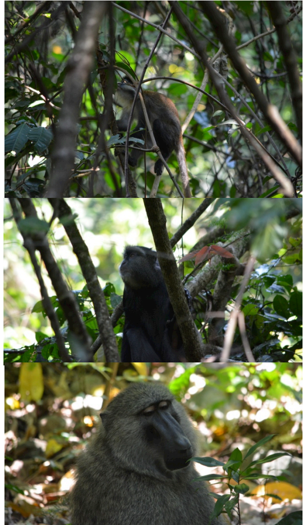
Figure 10. Red-tailed monkeys (top), blue monkey (middle), olive baboon (bottom).

In the afternoon, I went to the lake to swim and to watch the sunset, very peaceful and beautiful. In the evening, I ran back to the shore, and when I look up, I got stunned by all the stars that shone on that night. The image of the new moon reflecting on the lake is also something I cannot forget. And I had a really good sleep.