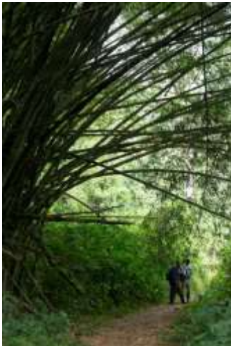
Me and local staffs checking the video on the road