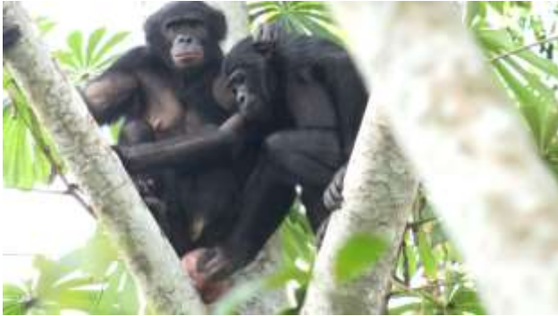
Grooming mother and female offspring