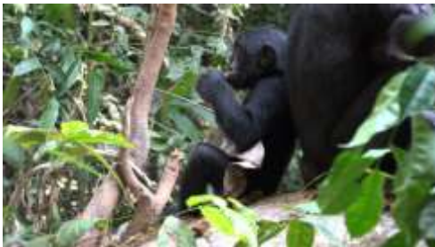
Male Infant holding the large leaf