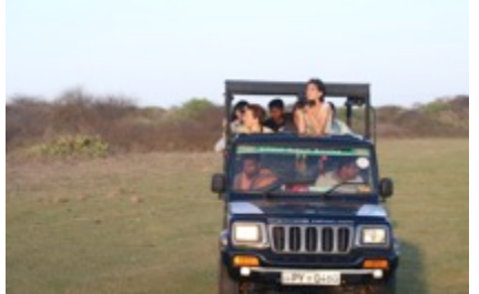
Jeep safari at Bundara National