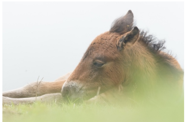
Photo6. Taking a rest