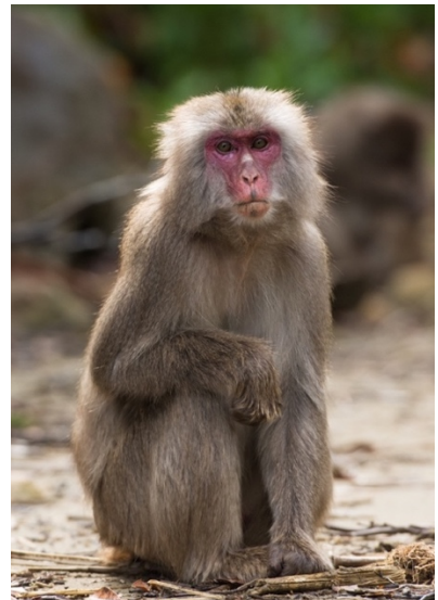
Photo4. Japanese macaque