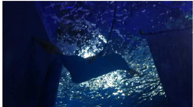
Ray fish above our head