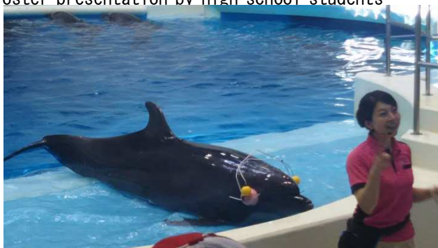
They showed echolocation of dolphins