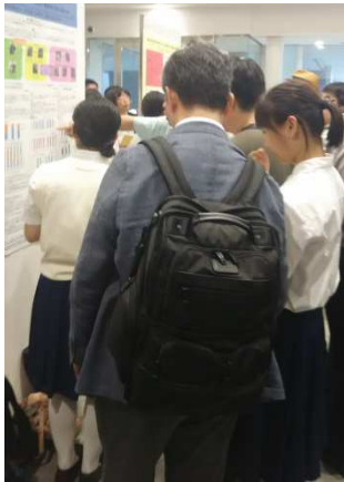
Poster presentation by high school students

During 5days, I heard interesting sessions got many comments for my poster presentation. I also visited aquarium and zoo. I am satisfied with trip.