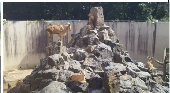
Barbary sheep and sacred baboon