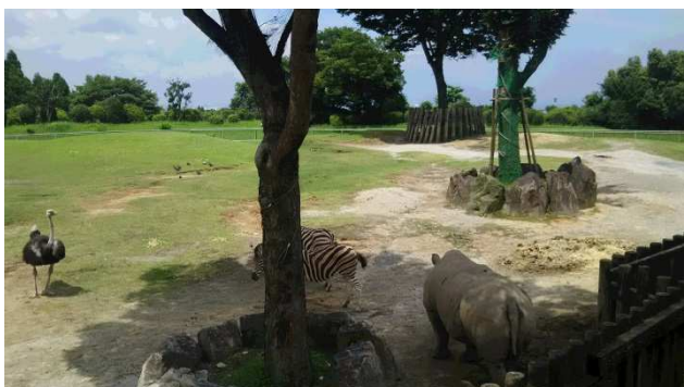
Exhibition of “African forest”