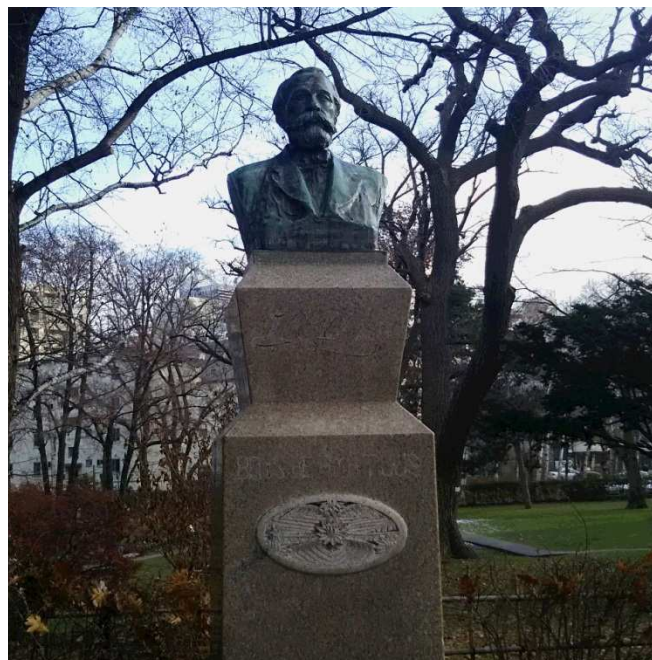
Dr. Clark statue of Hokkaido University