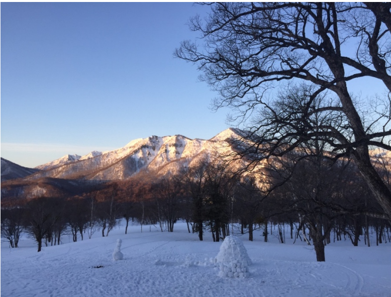
View from the Hutte at sunset with the igloo and snow person created earlier that day