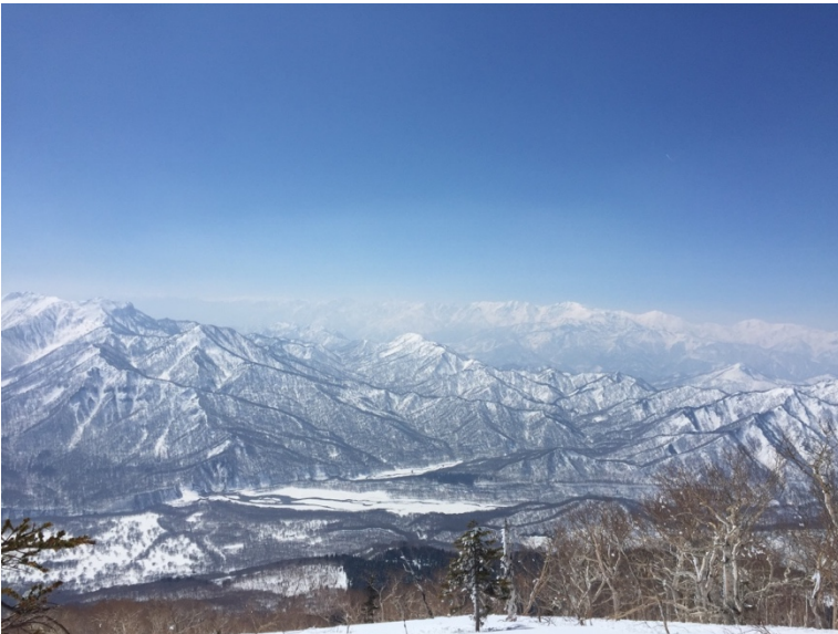
View from the summit of Mt. Mitahara