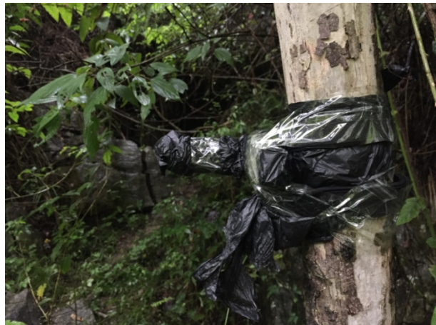
Video camera was set on the tree facing the cave