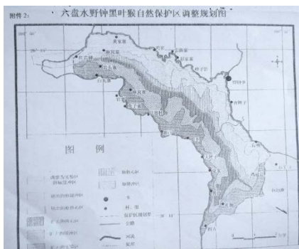
Map of Yezong Natural Reserve