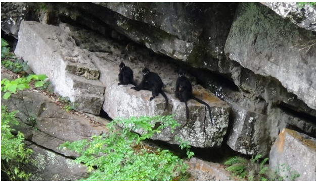
François' langurs near the entrance to a cave