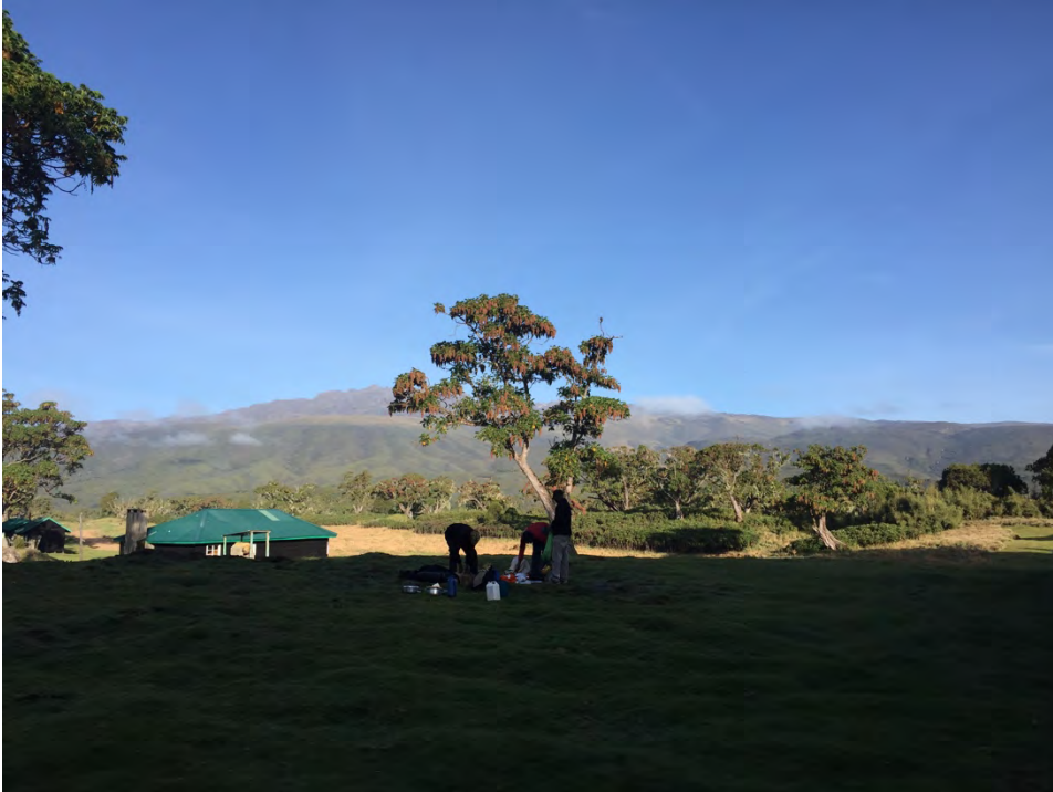
View from our cabin after the first day of hiking in Mt. Kenya National Park.