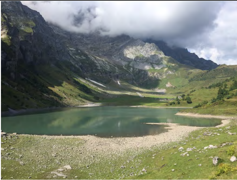
Lake Oberblegisee in the Swiss Alps, near Braunwald, Switzerland