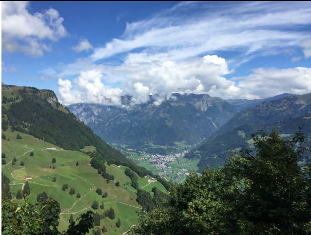
View of the Swiss Alps, near Braunwald, Switzerland