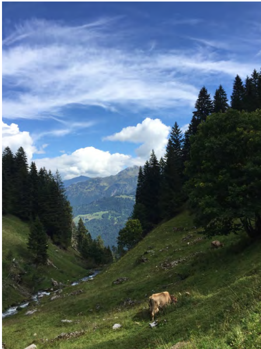
View of the Swiss Alps, near Braunwald, Switzerland