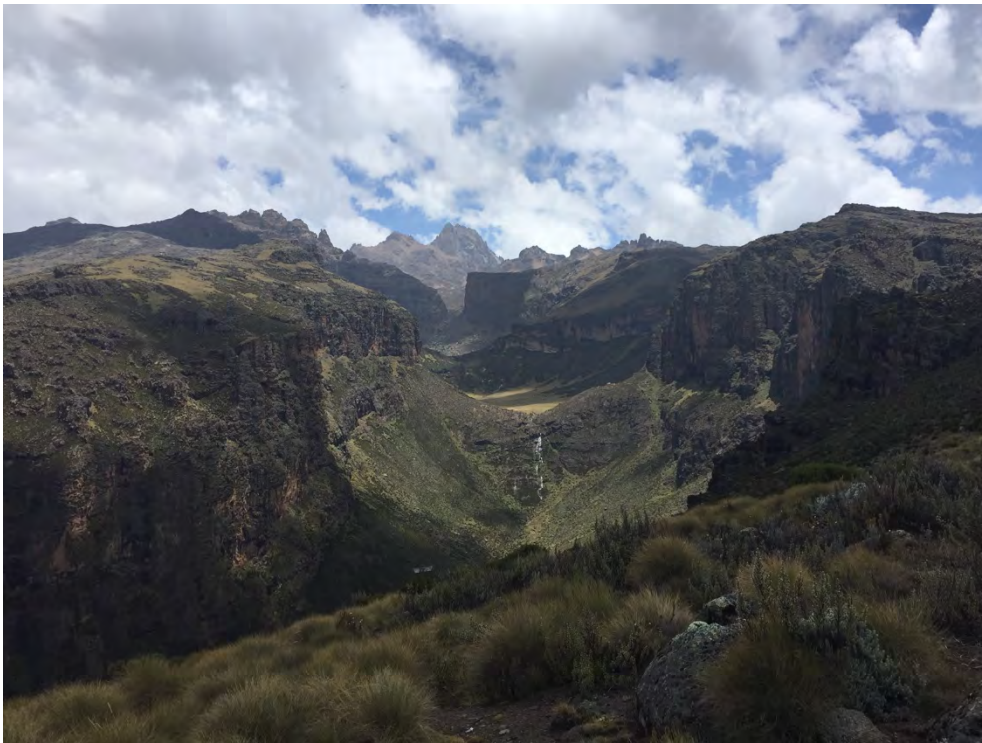
View into the gorge along the hike to the summit of Mt Kenya (seen in the far distance).