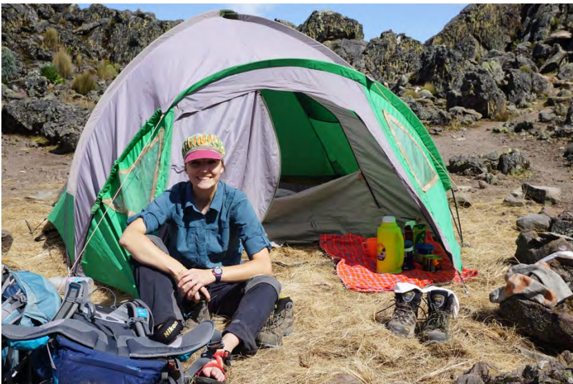
Our campsite after the second day of hiking and before our sunrise summit of Mt. Kenya the next morning.