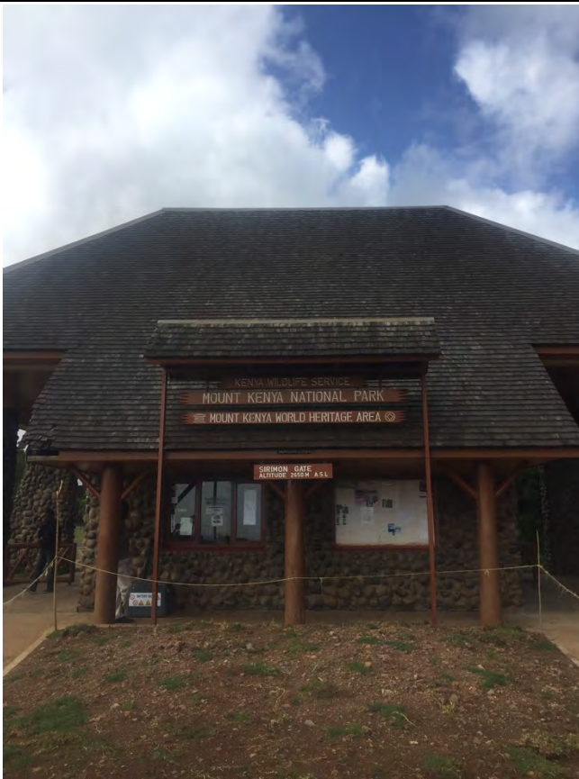
Sirimon Gate of Mt. Kenya National Park where we finished our 4 day trip.