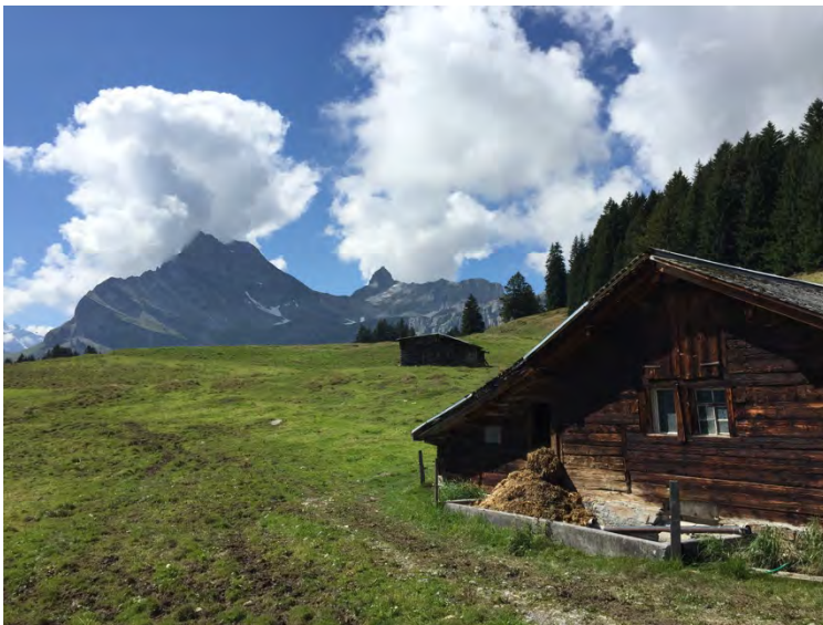
View of the Swiss Alps, near Braunwald, Switzerland