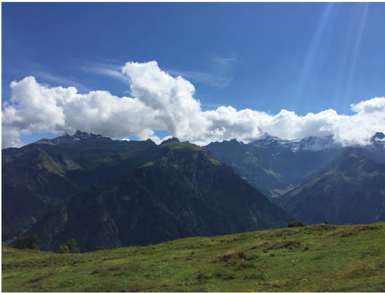
View of the Swiss Alps, near Braunwald, Switzerland