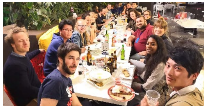
At our dinner of mainly graduate students from over 5 primate centers all over the world at Village Market in Kenya.