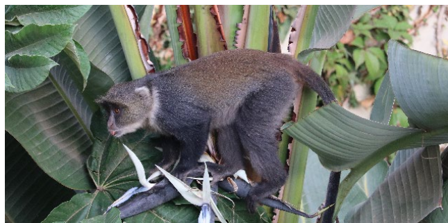
At the Latin America Primatology talks and a monkey eating flowers in the gardens of the UN Kenya.