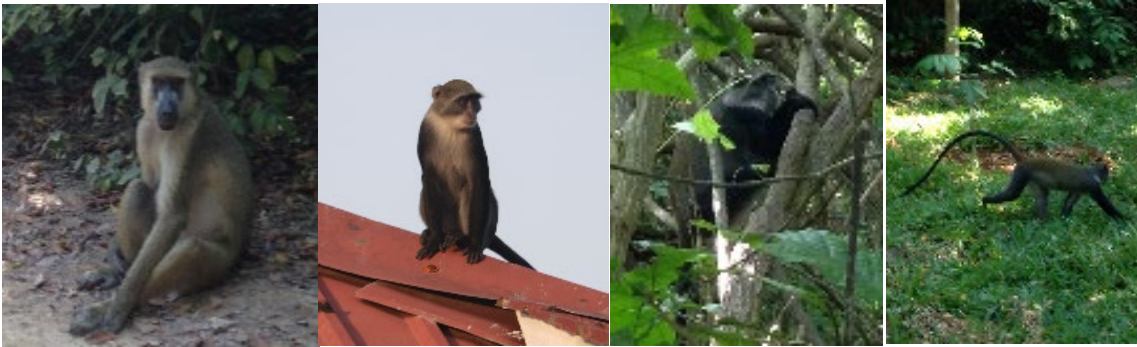
4 primate species that could be seen daily entering human habitat areas.