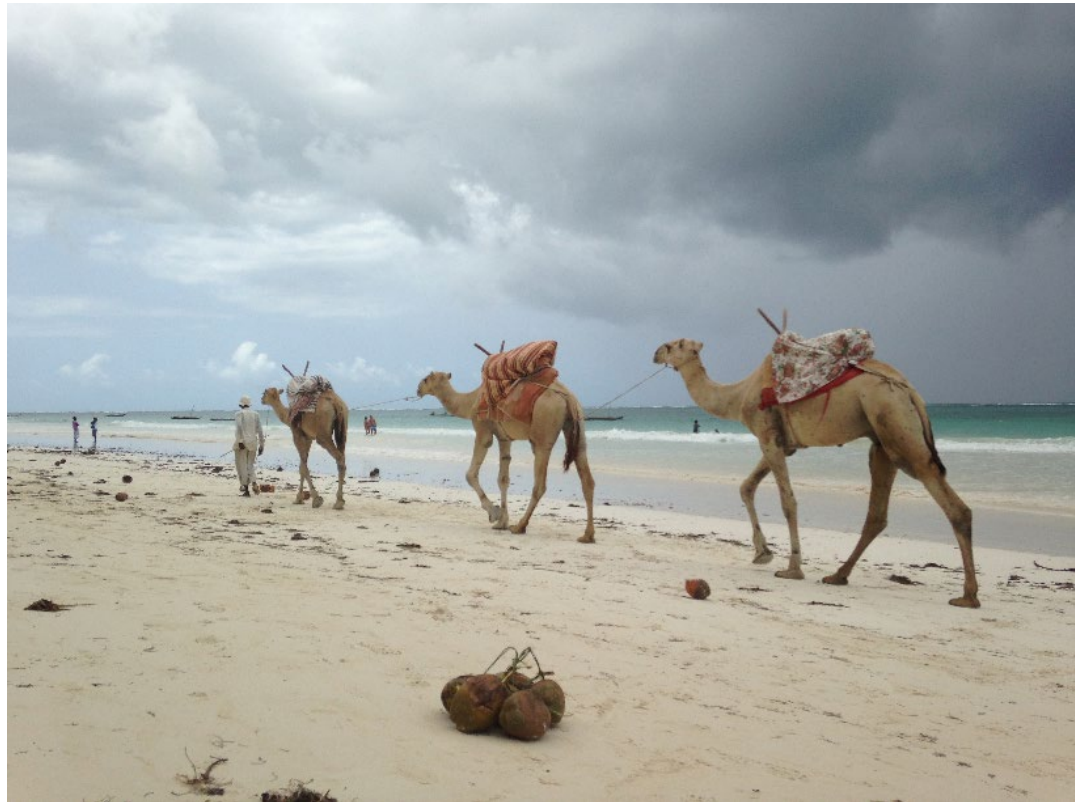
Masai local and camels at east coast in Kenya and a beautiful monkey walking along tree.