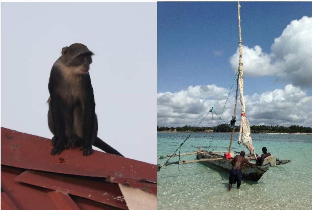
Monkey invading restaurant during breakfast and fishermen heading out in Kenyan coast.