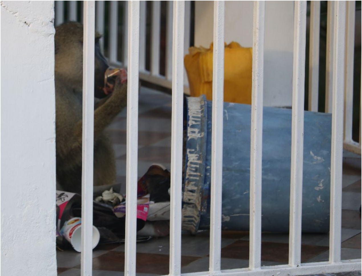
A baboon eating garbage from the hotel next to my room.