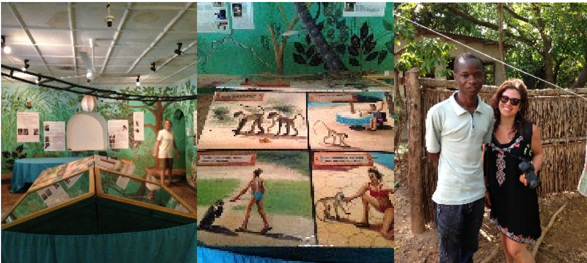
Visit to the Colobus Conservation Center and outreach tour by local volunteer student.