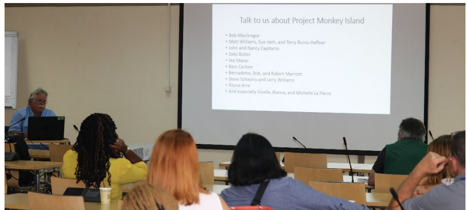
At my poster presentation with other nocturnal primate researchers and at the Behavioral Management presentations.