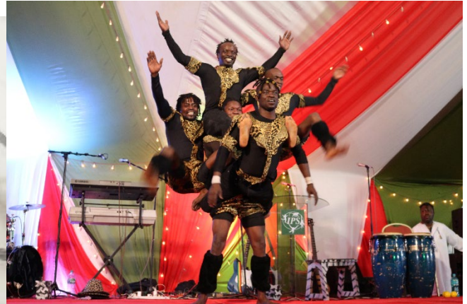
Phenomenal food in Kenya and cultural dance at closing banquet.