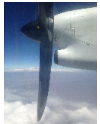
After my last day, from Nairobi to east Kenya, flying over Mt. Kilimanjaro to Ukunda for my visit to Colobus Conservation Center.