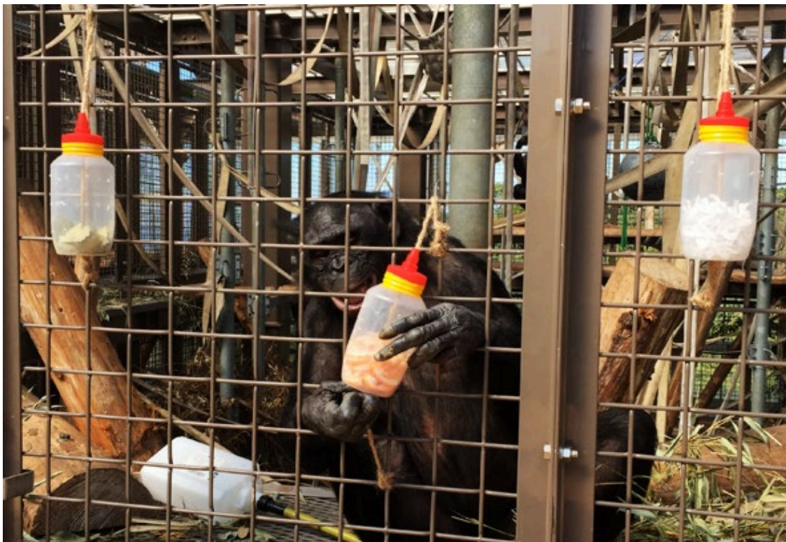
Bonobo manipulating grapefruit peels.