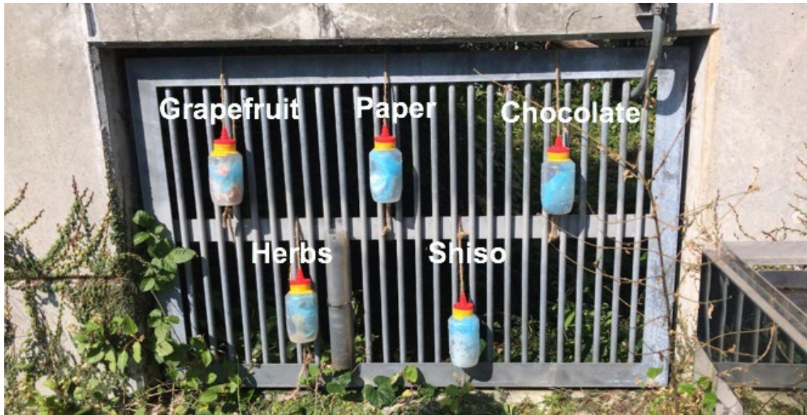
Example of olfactory device placement.