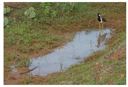
(mother with babies)

We also saw gray langurs and toque macaques there.