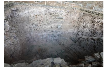
(the archeology site)

On the 21st, we had an excursion at Sinharaja Forest Reserve. It was a tropical rain forest. Apart from the typical rain forest plants, there were also planted trees as a part of the conservation project.