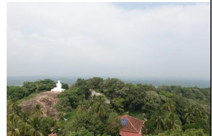
(view from Mihintale)