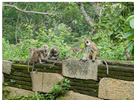
(macaques at Mihintale)