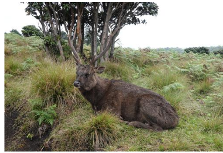
(a sambar deer at the parking lot)

We visited Sigiriya on the 25th. It is a World Heritage Site. We visited Mihintale on the next day. It was the world’s oldest wildlife sanctuary. Led by Prof. Charmalie Nahallage, we did a practice of focal sampling observation of the macaques there. We also visited the temple and rock remains in that area.