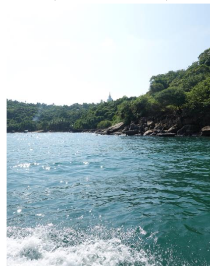
(on the sea)

On the 23rd, we joined a safari to observe water birds and other wildlife at Bundala National Park. There were many peacocks there. I was excited to see the courtship behavior by a peacock. A male displayed his tail feather to a female. The female was not very interested at first, and the male kept showing from different angles. The female started to approach and to examine him from different angles, but then walked away and continued to watch the show. We stayed there for more than ten minutes, but the female didn't make any choice within that period. Then we had to leave for the elephants nearby, but in the end, we could only see the back of two elephants.