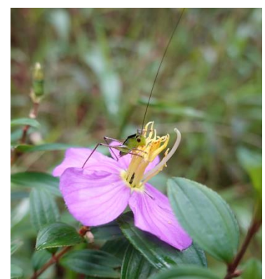
(a cricket on a flower)

We had a lecture about the marine ecology and corals that evening. I didn't do snorkeling because of my poor swimming skills on the next day, but I enjoyed the boat ride on the sea.