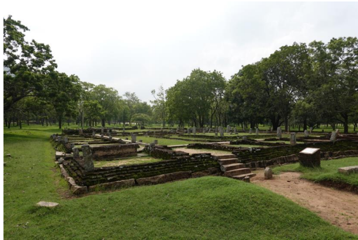
(the oldest hospital perhaps in the world, at Mihintale)

I was also very impressed about the archeological sites in Sri Lanka. Not only were there the oldest modern human civilizations, but also many pre-historical remains. It has been a wonderland for humans to live and grow.