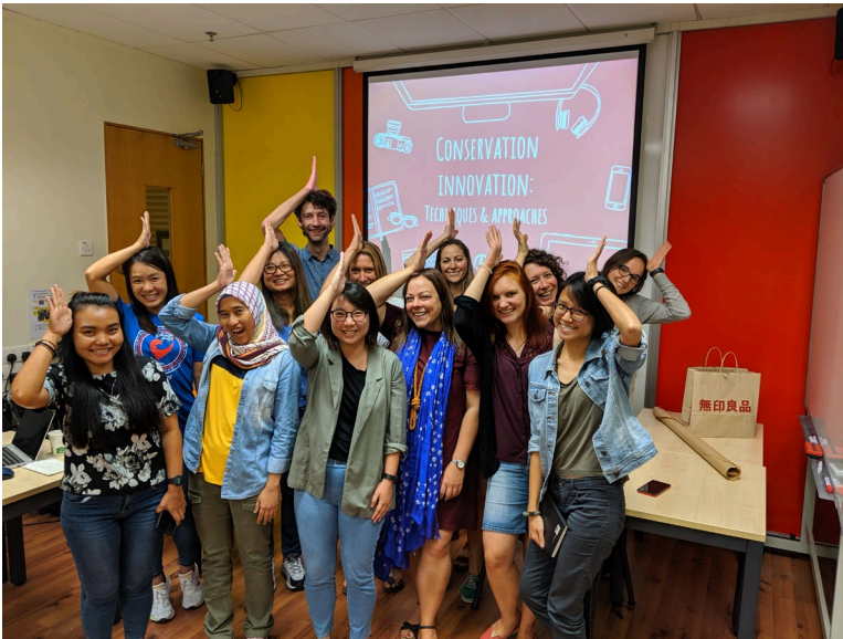
(picture from the Conservation Innovation workshop I participated in at ICCB 2019)