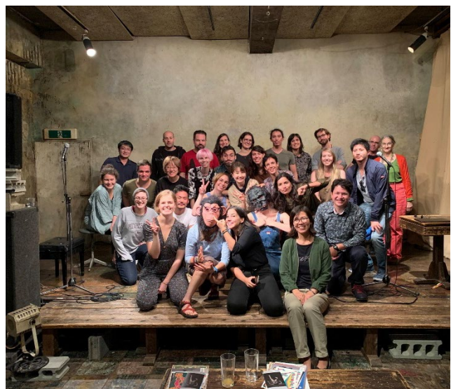
Group photo of Nerd Nite Kansai #09 x Conserv'Session