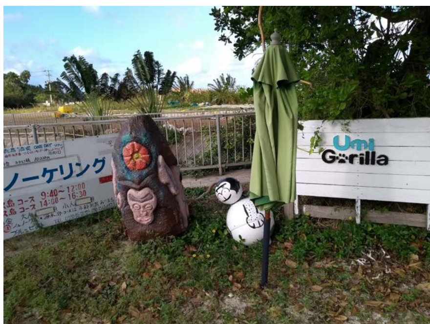
We passed “Umi Gorilla” on a walk to the village...