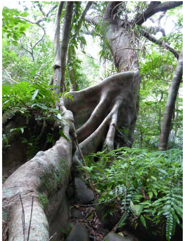
We passed beautiful ferns and buttress roots on our trek.