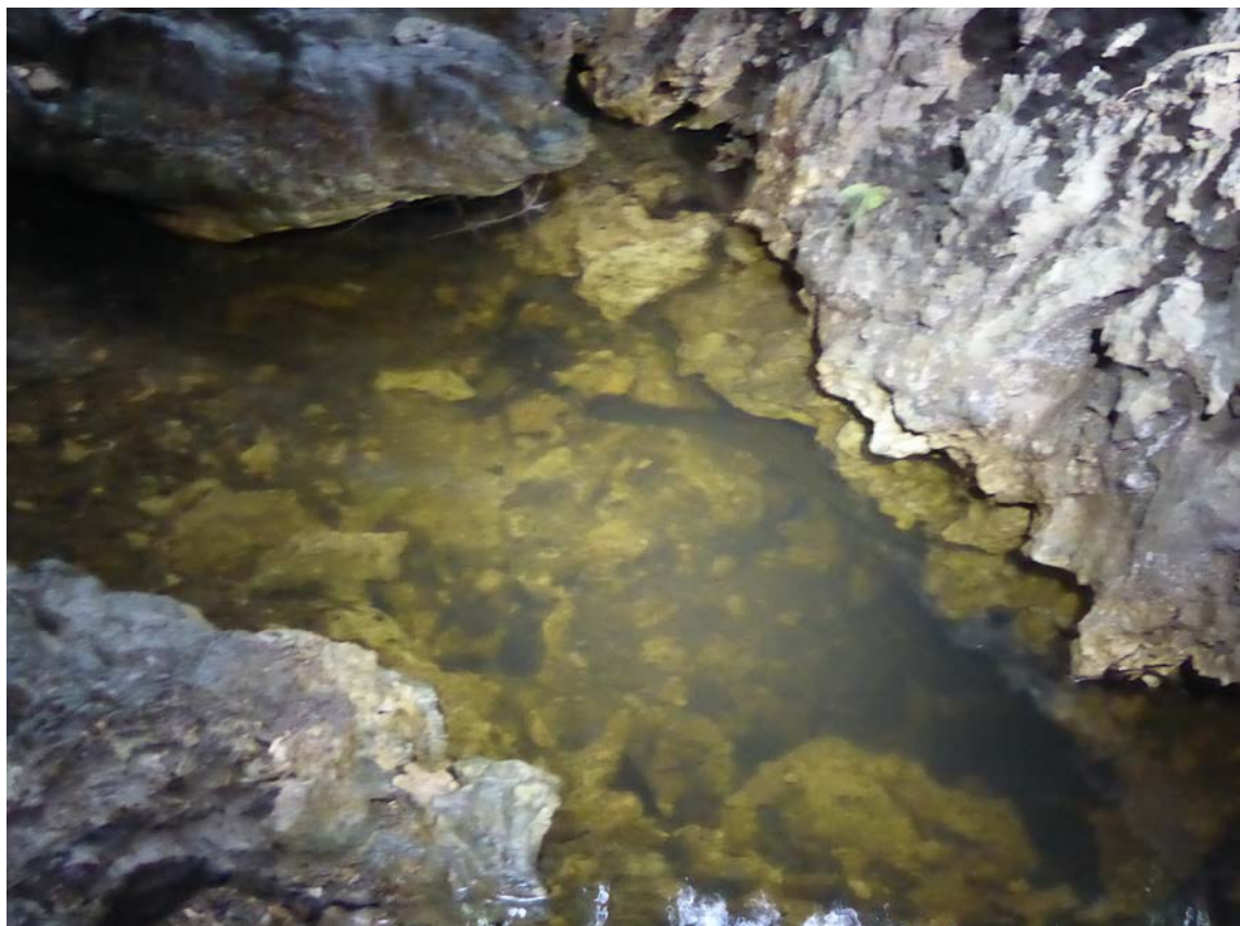
Not the best photo, but it's possible to see the eel we spotted in the cave.