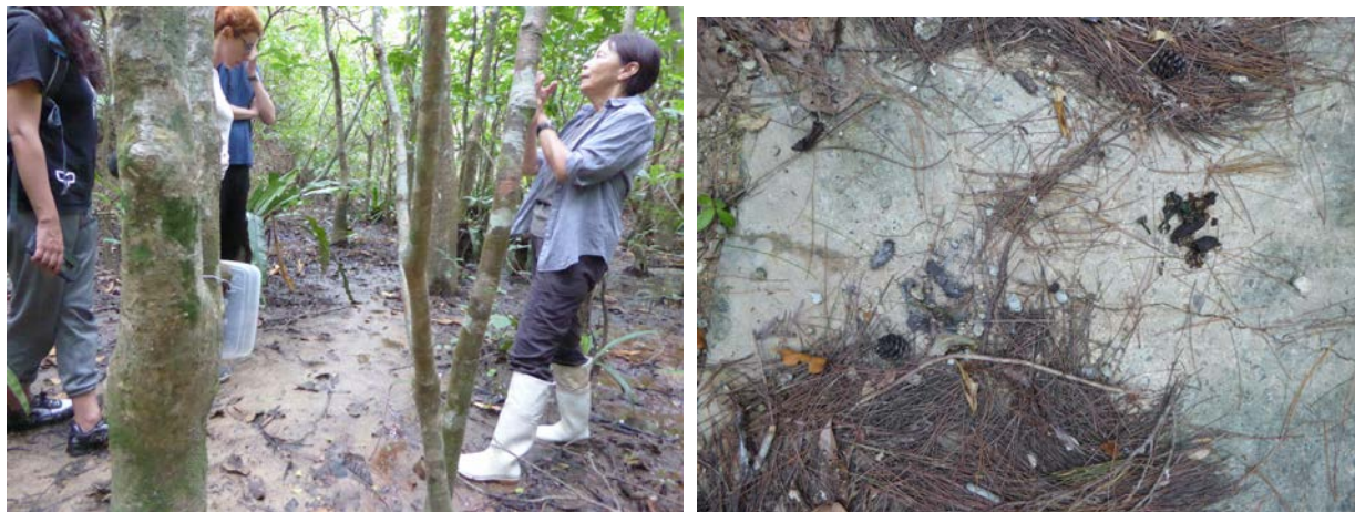
Camera traps and yamaneko scat (dark scat on the right = fresh feces, to the left = old feces).