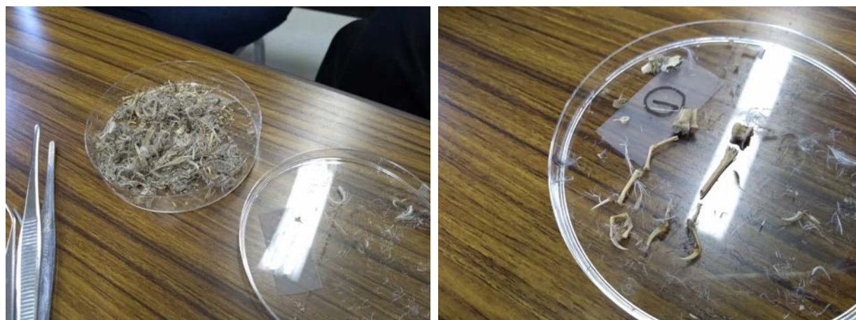
Sorting through already dried yamaneko scat, we could see that they had eaten some sort of bird.