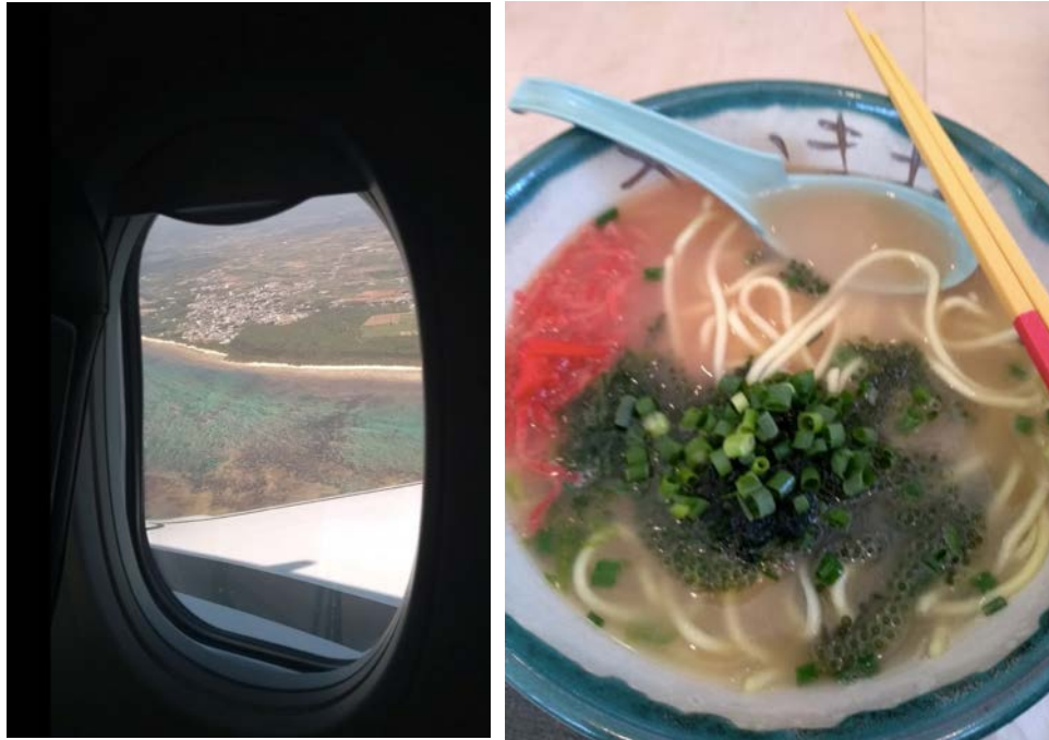
Making our way to Iriomote – and my favorite, 海ぶどう !