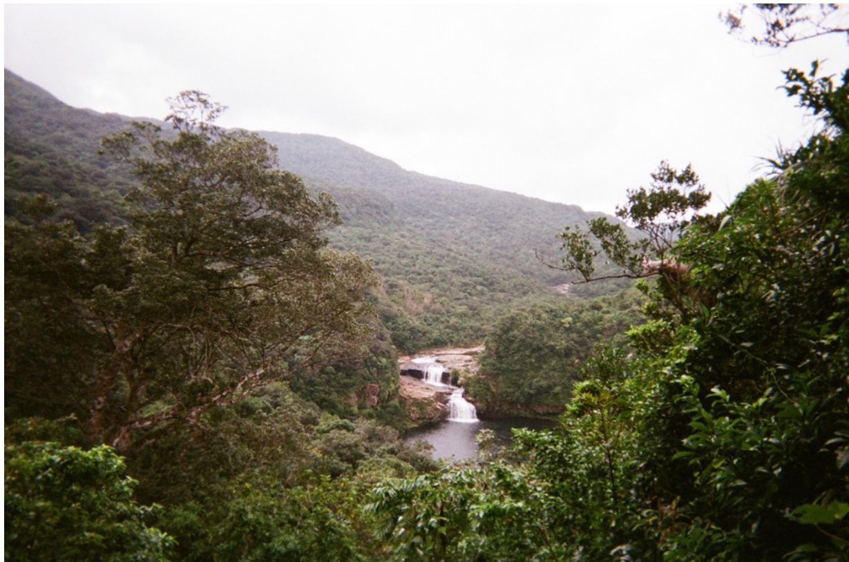
View of Kanbire waterfalls on our hike after getting off the Urauchi River boat.