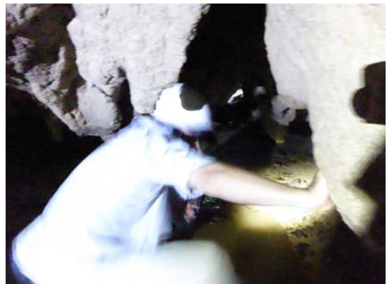
Difficult to see – a giant centipede in the cave. // We walked through ankle-deep water and crawled under small areas.