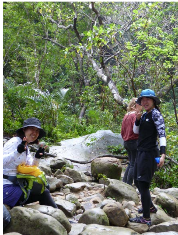
My kayak ‘engine’ ;- ) and having fun at the falls.