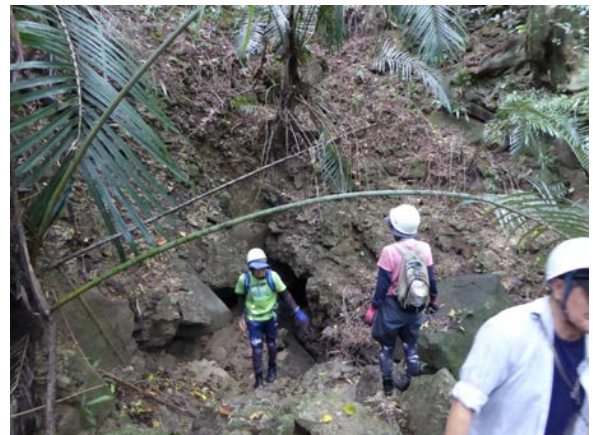
The entrance we took into the limestone cave. // The much smaller hole we exited from!