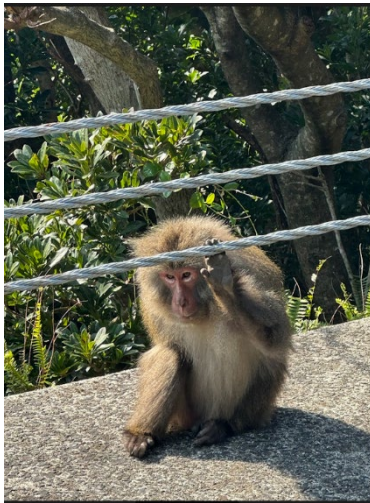
This monkey was named Fredrik. He can be identified by the scar on his lip, his white face markings and the white spot on the inside of his left hand