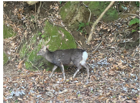
We were able to observe many deer during the course as well