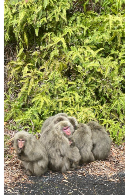
Frequently observed ‘Monkey Dango’ where the macaques huddle together for warmth in colder conditions

The final day was dedicated to observing monkeys. We were able to expand our knowledge of their range when we discovered them away from our regular observation spot. In the evening we were able to catalogue our findings of both the monkeys and whales (see figures).